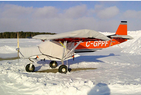
Zenith 701 Canopy, Wing, Tail & Insulated Engine Covers