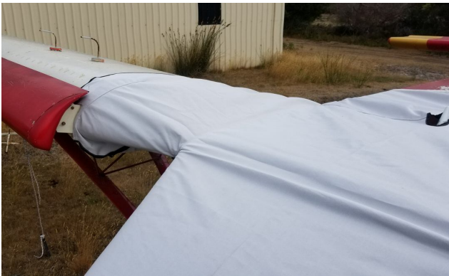
Zenair 801 Extended Canopy Cover (Over-the-Top Style)