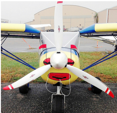
ENGINE PLUGS PREVENT BIRD NEST FOD. Piper Saratoga Engine Cowling Bird's Nest Zenith 701 Engine Inlet Plugs