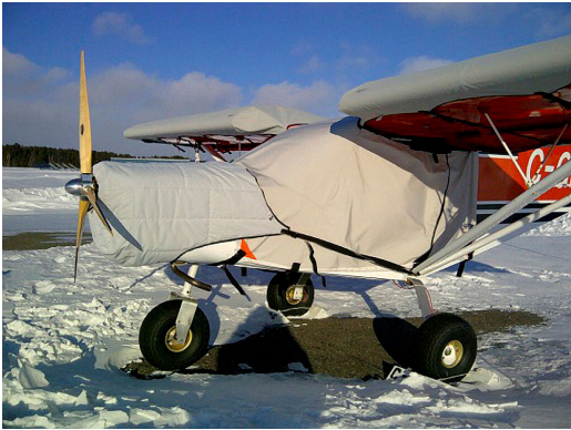
Zenith 701 Canopy, Wing, Tail & Insulated Engine Covers

This cover type is made from Silver Acrylic Sunbrella canvas and is 100% lined with a soft and smooth microfiber. Bruce's Custom Covers developed this material combination especially for aircraft protection. The outer material is medium weight and treated for water resistance, UV resistance and anti-static buildup. The inner lining is a very soft and smooth microfiber to prevent scratching. The material is very reflective, and tests show that the cabin interior temperature can be reduced to near-ambient temperature on the hottest of days. It is water, ice and snow repellent, yet breathable to allow moisture to escape from between the cover and the aircraft surface.