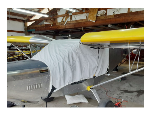
Zenair 750 Over The Top Style Canopy Cover