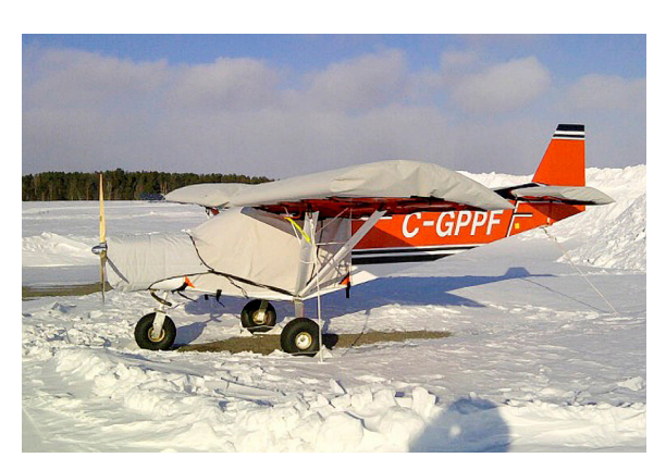
Zenith 701 Canopy, Wing, Tail & Insulated Engine Covers