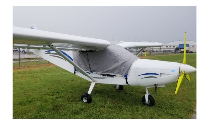
Zenith Z750 Cruzer Travel Canopy Cover