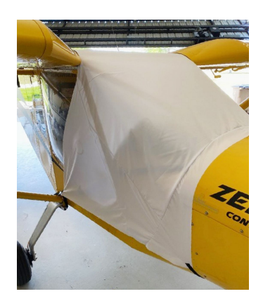
Zenith 750 Windshield Cover

This cover type is made from Silver Acrylic Sunbrella canvas and is 100% lined with a soft and smooth microfiber. Bruce's Custom Covers developed this material combination especially for aircraft protection. The outer material is medium weight and treated for water resistance, UV resistance and anti-static buildup. The inner lining is a very soft and smooth microfiber to prevent scratching. The material is very reflective, and tests show that the cabin interior temperature can be reduced to near-ambient temperature on the hottest of days. It is water, ice and snow repellent, yet breathable to allow moisture to escape from between the cover and the aircraft surface.