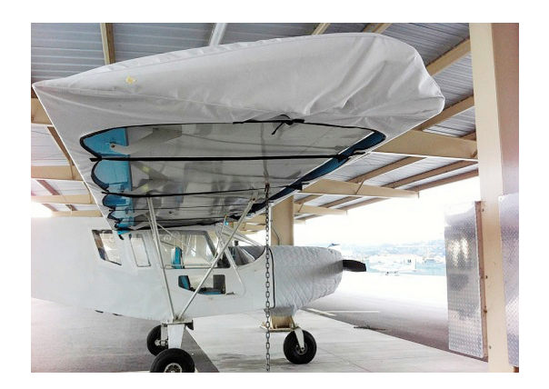
Zenith 801 Wing & Insulated Engine Covers

WINTER USE MATERIAL - Made with Solution-Dyed Polyester fabric, this option is intended for seasonal use to aid in deicing, rain mitigation, or for occasional travel. The material is lighter and more compact, but more susceptible to UV damage and may have a shorter useful life if used continuously outside than the all-year use material.