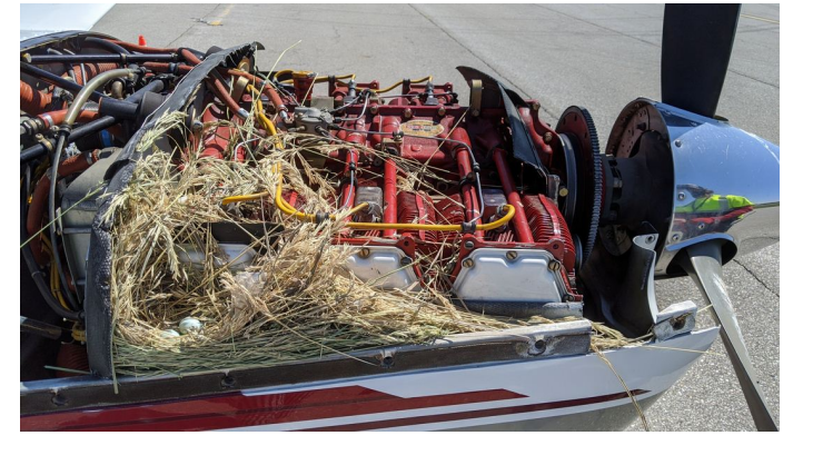
Zenith 701 Engine Inlet Plugs