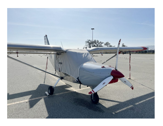
Zenair 750 & Cruzer Extended Canopy Cover