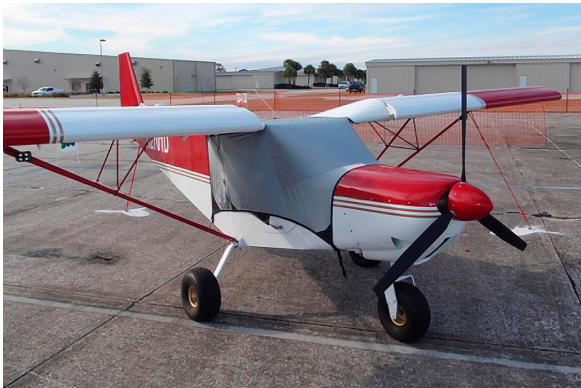
Zenith 701 Spandex FlyAway Travel Canopy Cover