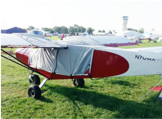
Zenith 701 Travel Canopy with wing extensions to cover gas caps.

This cover type is made from Silver Acrylic Sunbrella canvas and is 100% lined with a soft and smooth microfiber. Bruce's Custom Covers developed this material combination especially for aircraft protection. The outer material is medium weight and treated for water resistance, UV resistance and anti-static buildup. The inner lining is a very soft and smooth microfiber to prevent scratching. The material is very reflective, and tests show that the cabin interior temperature can be reduced to near-ambient temperature on the hottest of days. It is water, ice and snow repellent, yet breathable to allow moisture to escape from between the cover and the aircraft surface.