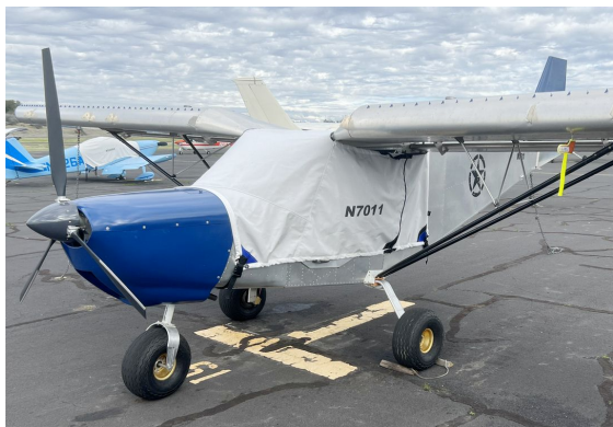
Zenith 701 Canopy Cover, Over Top Type

the hottest of days. It is water, ice and snow repellent, yet breathable to allow moisture to escape from between the cover and the aircraft surface.