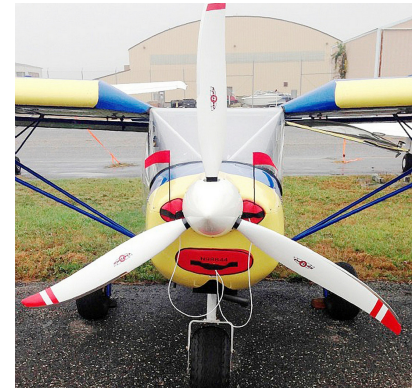
ENGINE PLUGS PREVENT BIRD NEST FOD. Piper Saratoga Engine Cowling Bird's Nest Zenith 701 Engine Inlet Plugs