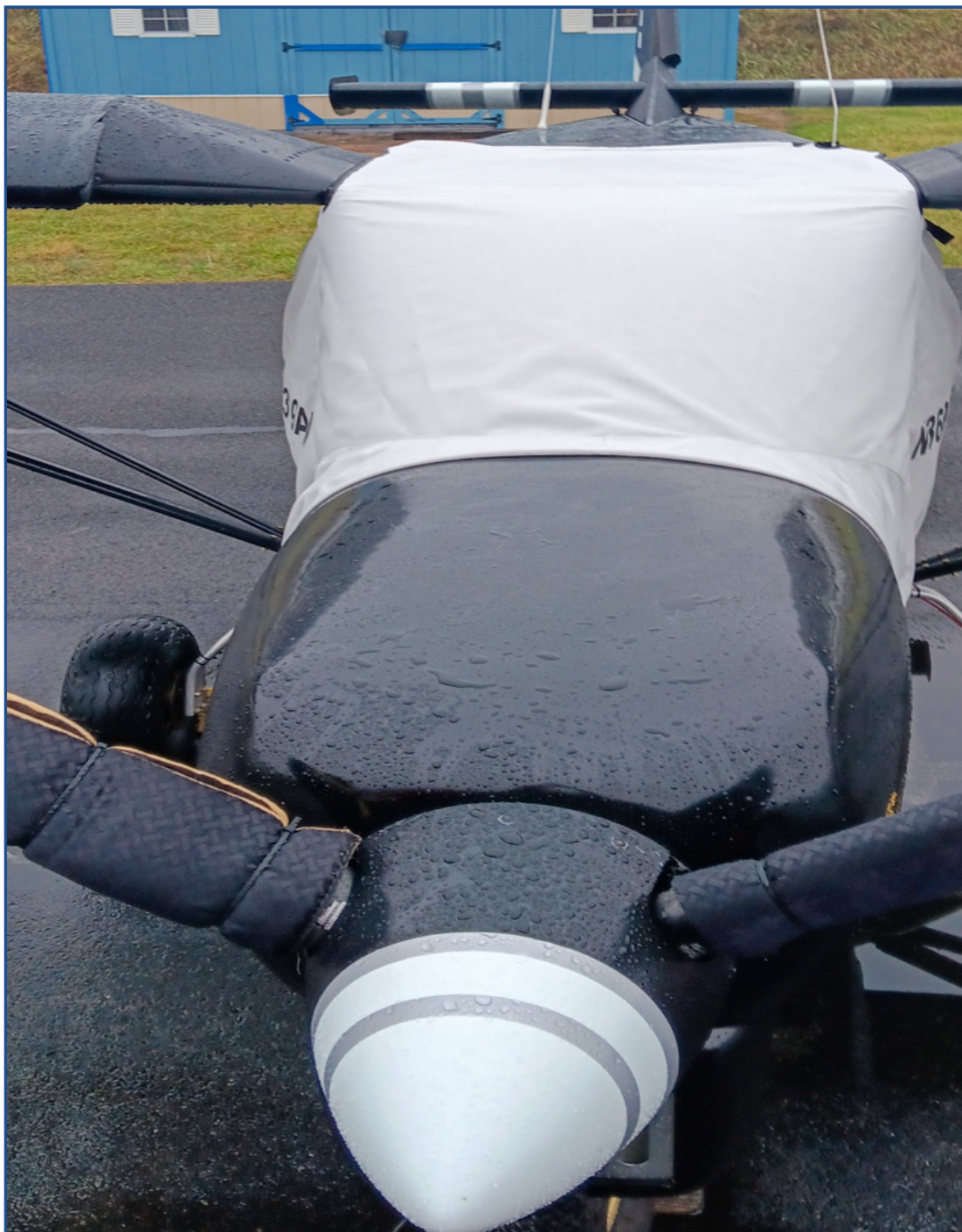
ZENITH STOL CH 701 Canopy Cover, Over Top Type, Belly Strap Type