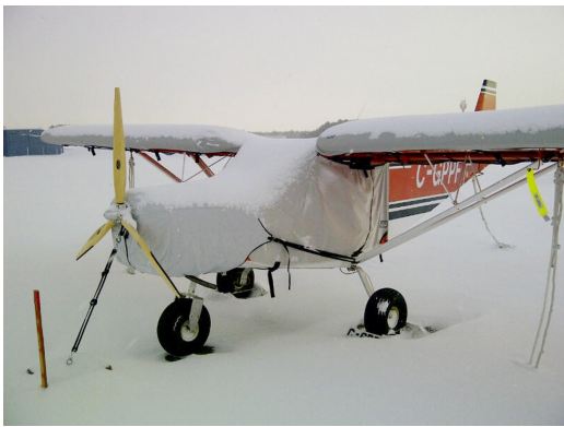
Zenith 701 Canopy, Wing, Tail & Insulated Engine Covers