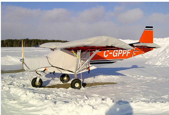
Zenith 701 Canopy, Wing, Tail & Insulated Engine Covers