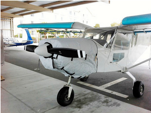
Zenith 801 Insulated Engine Cover

This cover type is made from Silver Acrylic Sunbrella canvas and is 100% lined with a soft and smooth microfiber. Bruce's Custom Covers developed this material combination especially for aircraft protection. The outer material is medium weight and treated for water resistance, UV resistance and anti-static buildup. The inner lining is a very soft and smooth microfiber to prevent scratching. The material is very reflective, and tests show that the cabin interior temperature can be reduced to near-ambient temperature on the hottest of days. It is water, ice and snow repellent, yet breathable to allow moisture to escape from between the cover and the aircraft surface.