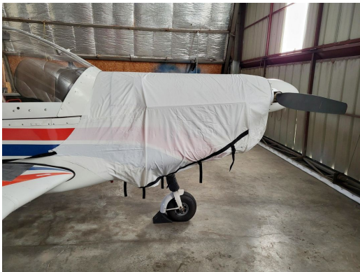
Zlin 142C Engine Cover, test fit cover