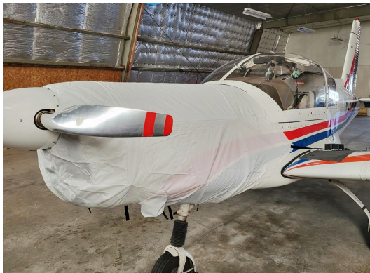
Zlin 142C Engine Cover, test fit cover

This cover type is made from Silver Acrylic Sunbrella canvas and is 100% lined with a soft and smooth microfiber. Bruce's Custom Covers developed this material combination especially for aircraft protection. The outer material is medium weight and treated for water resistance, UV resistance and anti-static buildup. The inner lining is a very soft and smooth microfiber to prevent scratching. The material is very reflective, and tests show that the cabin interior temperature can be reduced to near-ambient temperature on the hottest of days. It is water, ice and snow repellent, yet breathable to allow moisture to escape from between the cover and the aircraft surface.