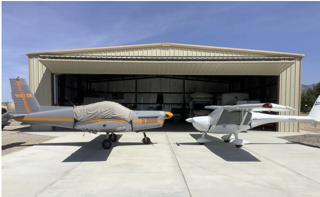
G-3/600 Travel Cover and Zlin 142 Canopy Cover