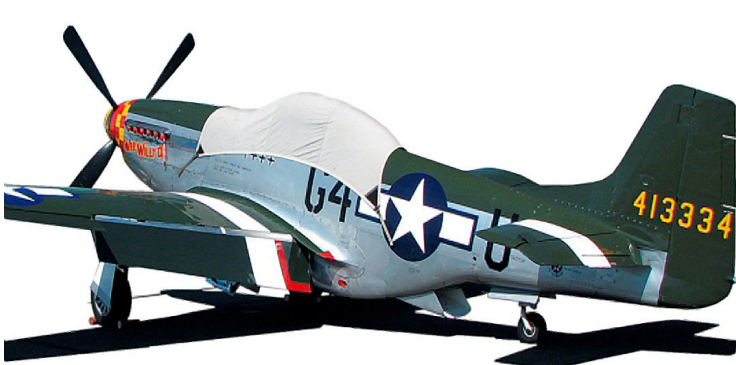
North American P51 Canopy Cover & Exhaust Plugs