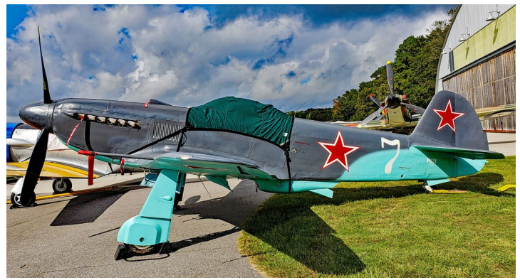
Yakovlev Yak 3 Canopy Cover (3u Models: Longer Canopy)