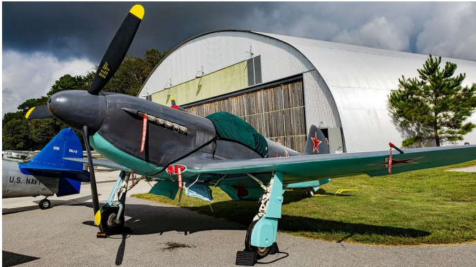
Yakovlev Yak 3 Oil Cooler Inlet Plugs (In Wing Root)

Engine Inlet Plugs are custom fit for your Yakovlev Yak 3 intakes, made with heavy-duty vinyl material, and stuffed with a single block of sculpted urethane foam. Each plug has a zipper that allows the foam to be removed and dried if necessary. Engine plugs have warning flags that are visible from the cockpit or 'remove before flight' streamers sewn onto the face of the plugs. Most plugs are imprinted with the aircraft registration number in black for an extra charge. Storage bag NOT included. Engine plugs may be inserted after flight when the engine is still warm. Engine Inlet Plugs are commonly referred to as Cowl Plugs, Intake Plugs, Cowl Blocks, Engine Blocks, and Engine Bungs.