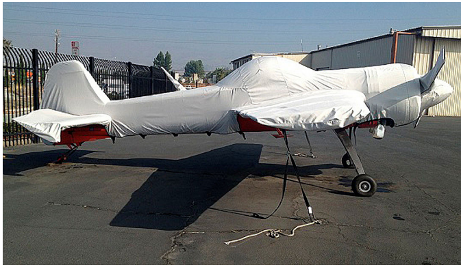
Yak 11 Canopy Cover, Plugs & Pitot Covers Yak 55 Full Fuselage Cover w/ Detachable Wing Covers & Propellor/Spinner Cover