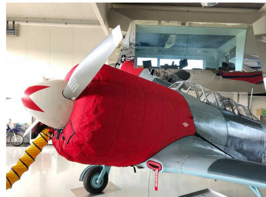
Yak 11 Insulated Engine Cover & Oil Cooler Inlet Plug