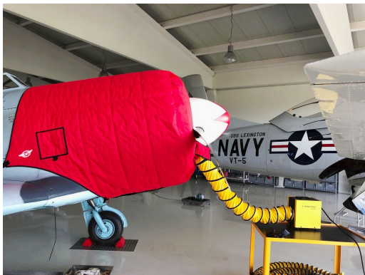
Yak 11 Insulated Engine Cover

Engine Inlet Plugs are custom fit for your Yakovlev Yak 11 intakes, made with heavy-duty vinyl material, and stuffed with a single block of sculpted urethane foam. Each plug has a zipper that allows the foam to be removed and dried if necessary. Engine plugs have warning flags that are visible from the cockpit or 'remove before flight' streamers sewn onto the face of the plugs. Most plugs are imprinted with the aircraft registration number in black for an extra charge. Storage bag NOT included. Engine plugs may be inserted after flight when the engine is still warm. Engine Inlet Plugs are commonly referred to as Cowl Plugs, Intake Plugs, Cowl Blocks, Engine Blocks, and Engine Bungs.