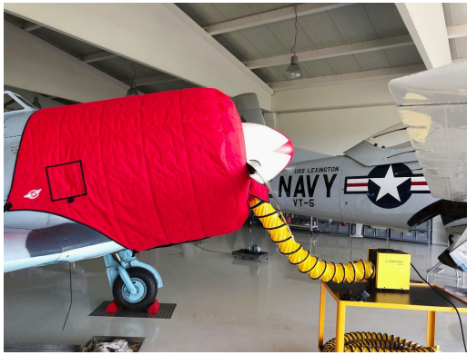
Yak 11 Insulated Engine Cover