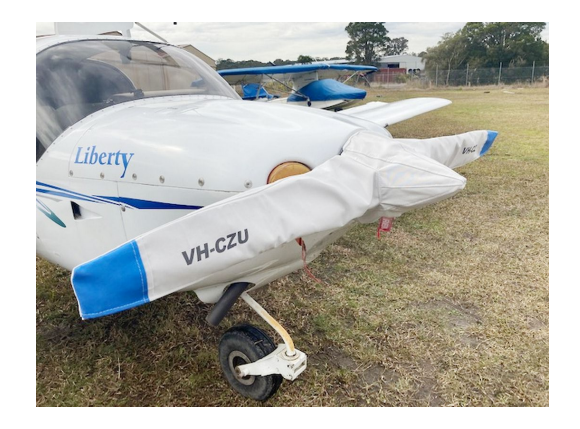
XL-2 PROPELLOR/SPINNER COVER