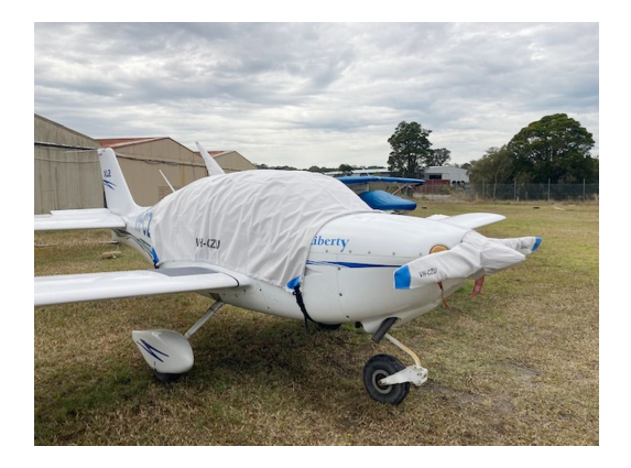
XL-2 CANOPY COVER

This cover type is made from Silver Acrylic Sunbrella canvas and is 100% lined with a soft and smooth microfiber. Bruce's Custom Covers developed this material combination especially for aircraft protection. The outer material is medium weight and treated for water resistance, UV resistance and anti-static buildup. The inner lining is a very soft and smooth microfiber to prevent scratching. The material is very reflective, and tests show that the cabin interior temperature can be reduced to near-ambient temperature on the hottest of days. It is water, ice and snow repellent, yet breathable to allow moisture to escape from between the cover and the aircraft surface.