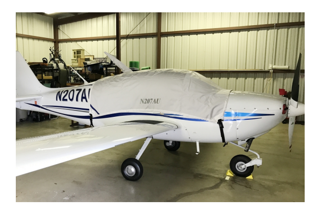
Liberty Aerospace Liberty XL-2 Canopy Cover