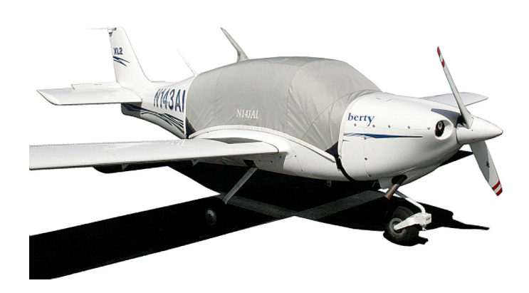
XL-2 Canopy Cover

This cover type is made from Silver Acrylic Sunbrella canvas and is 100% lined with a soft and smooth microfiber. Bruce's Custom Covers developed this material combination especially for aircraft protection. The outer material is medium weight and treated for water resistance, UV resistance and anti-static buildup. The inner lining is a very soft and smooth microfiber to prevent scratching. The material is very reflective, and tests show that the cabin interior temperature can be reduced to near-ambient temperature on the hottest of days. It is water, ice and snow repellent, yet breathable to allow moisture to escape from between the cover and the aircraft surface.