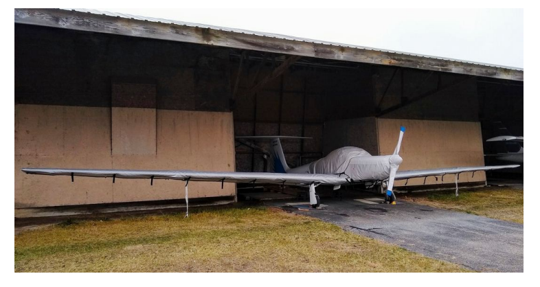
Aeromot Ximango Extended Canopy Cover, Engine, Prop & Wing Covers