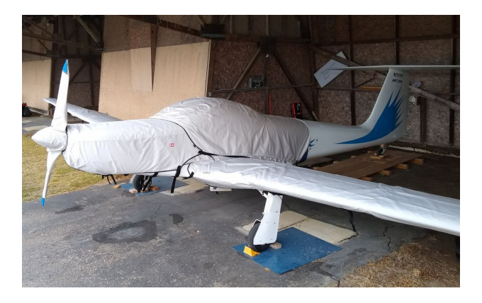
Aeromot Ximango Extended Canopy Cover, Engine, Prop & Wing Covers