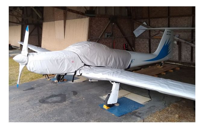
Aeromot Ximango Extended Canopy Cover, Engine, Prop & Wing Covers

WINTER USE MATERIAL - Made with Solution-Dyed Polyester fabric, this option is intended for seasonal use to aid in deicing, rain mitigation, or for occasional travel. The material is lighter and more compact, but more susceptible to UV damage and may have a shorter useful life if used continuously outside than the all-year use material.