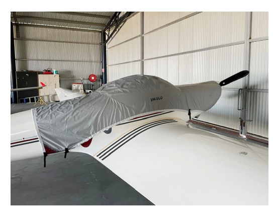
Ximango Travel Weight Canopy/Engine Cover