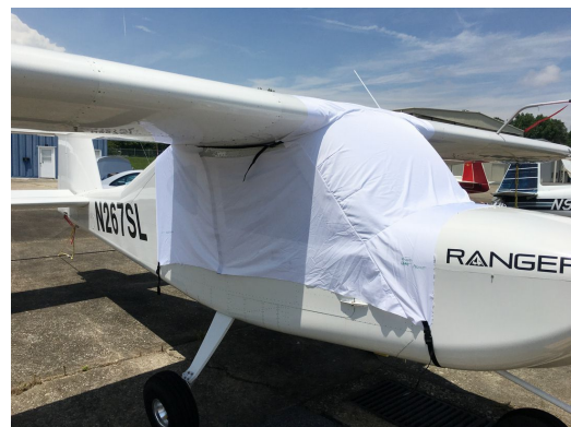
Vashon Ranger VR-7 Canopy Cover, test fit cover