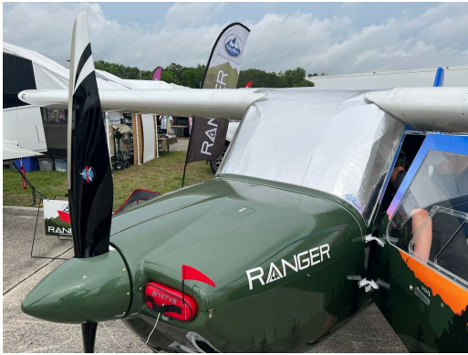
Vashon Ranger VR-7 Engine Plugs, Windshield HeatShield

foam with a silver mylar finish. The semi-rigid design is stiff enough to stand along the inside of the windshield using sun visors or window framing. It folds up flat and easily stores in the included storage sleeve. Some designs may require velcro and suction cups or split right and left sides. A Heatshield is an excellent short-term remedy for cockpit overheating. An external fabric cover is far more effective and practical for long-term protection.