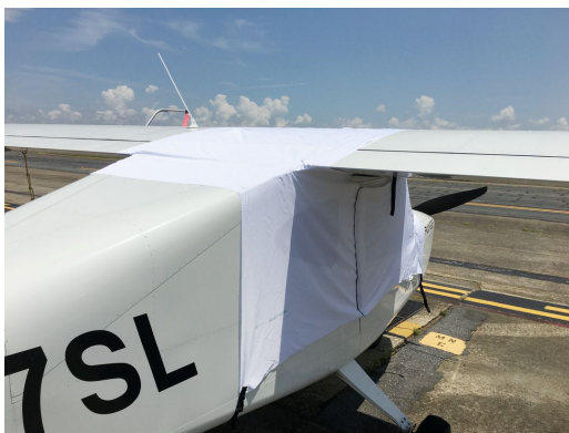
Vashon Ranger VR-7 Canopy Cover, test fit cover

Travel Covers are made with Silver Solution-Dyed Polyester fabric and only lined over the windshield to save weight. The material is lightweight and more compact for easy stowage in the aircraft. The polyester material is water resistant, but only intended for occasional use outside. We also have an ultra lightweight material available for fitted hangar dust covers. For daily outdoor use, the non-travel Sunbrella Cover is the best choice.