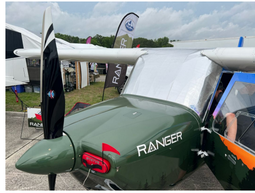
Vashon Ranger VR-7 Engine Plugs, Windshield HeatShield