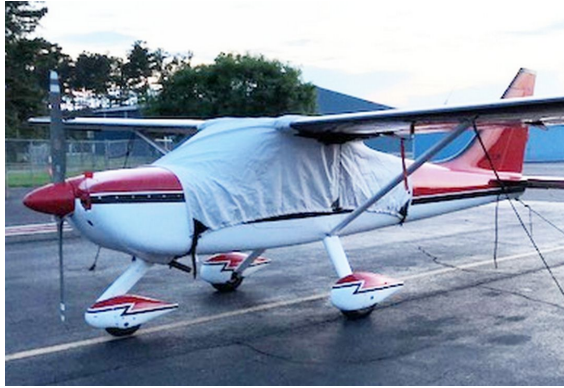
Glasair Aviation Glastar, Sportsman 2+2 Canopy Cover (Over-The-Top Style)