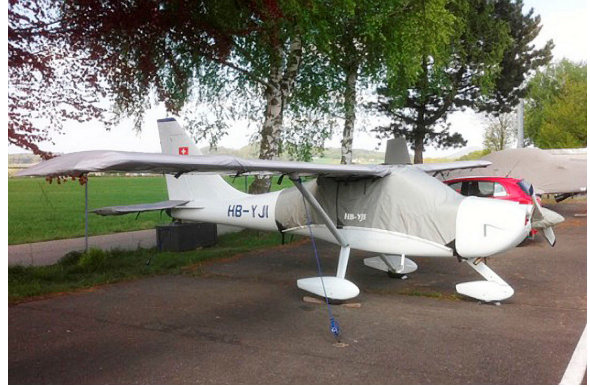
Glasair Aviation Glastar, Sportsman 2+2 Insulated Engine Cover OMF Symphony Canopy, Wings, Horiz. Stab, and Prop Covers