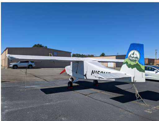
Vashon R7 Ranger Canopy/Engine, Wing & Horiz. Stab. Covers, fully enclosed

WINTER USE MATERIAL - Made with Solution-Dyed Polyester fabric, this option is intended for seasonal use to aid in deicing, rain mitigation, or for occasional travel. The material is lighter and more compact, but more susceptible to UV damage and may have a shorter useful life if used continuously outside than the all-year use material.