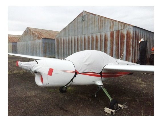
Vivat Canopy and Prop/Spinner Cover