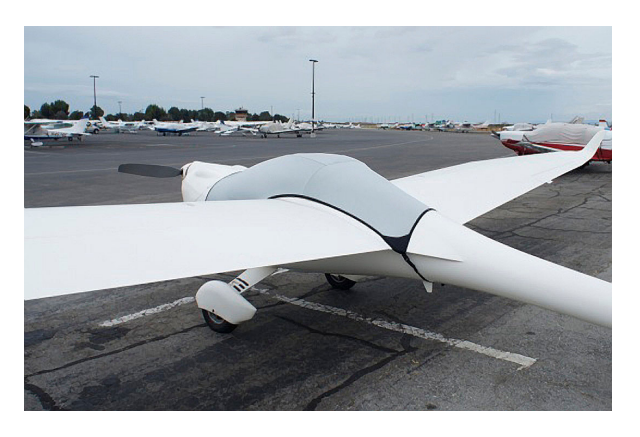
Lambada Canopy/Engine Cover and Wing Covers