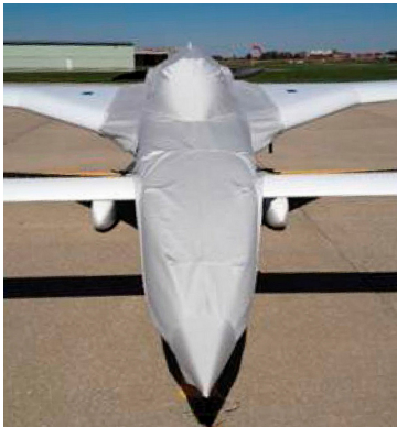
Long EZ Canopy/Nose/Engine Cover w/ Wing Extensions