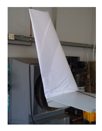
Velocity Canopy/Nose/Engine Cover, wing coverage varies