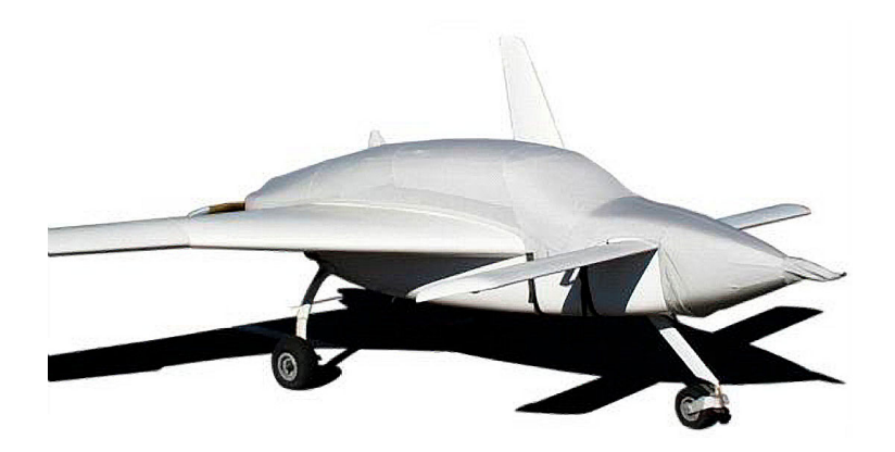
Velocity Canopy/Nose/Engine Cover

Travel Covers are made with Silver Solution-Dyed Polyester fabric and only lined over the windshield to save weight. The material is lightweight and more compact for easy stowage in the aircraft. The polyester material is water resistant, but only intended for occasional use outside. We also have an ultra lightweight material available for fitted hangar dust covers. For daily outdoor use, the non-travel Sunbrella Cover is the best choice.