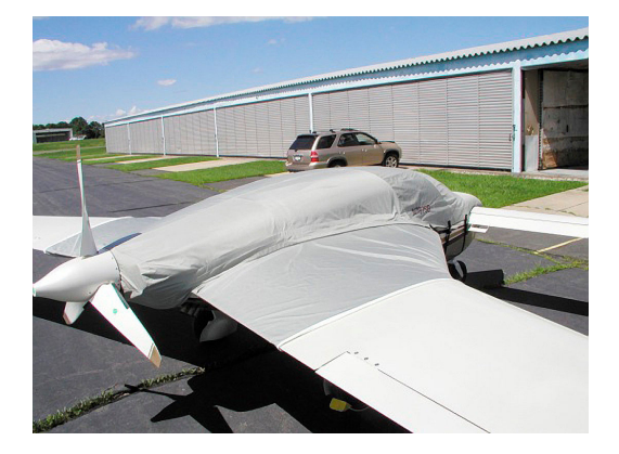
Velocity Canopy/Engine/Nose with Abbreviated Wing Covers