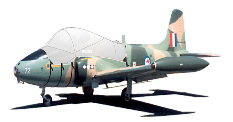
Jet Provost Canopy Cover (Illustration)

Travel Covers are made with Silver Solution-Dyed Polyester fabric and only lined over the windshield to save weight. The material is lightweight and more compact for easy stowage in the aircraft. The polyester material is water resistant, but only intended for occasional use outside. We also have an ultra lightweight material available for fitted hangar dust covers. For daily outdoor use, the non-travel Sunbrella Cover is the best choice.