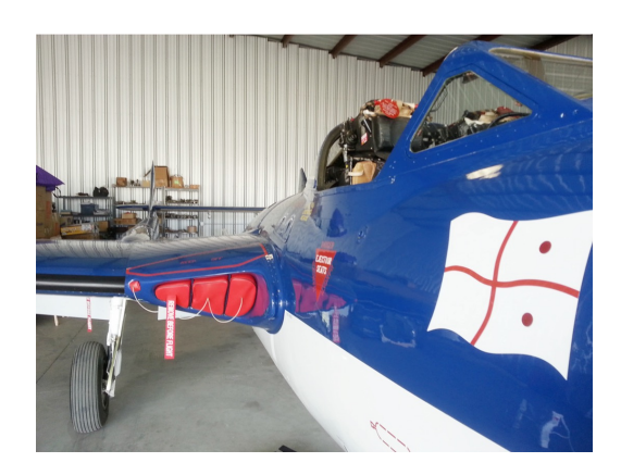
DeHavilland Vampire Engine Plugs

The Engine Inlet Plugs are custom fit for your DeHavilland Vampire intakes, made with heavy-duty vinyl material, and stuffed with a single block of sculpted urethane foam. Each plug has a zipper that allows the foam to be removed and dried if necessary. Engine plugs have 'remove before flight' streamers sewn onto the face of the plugs. Most plugs are imprinted with the aircraft registration number in black for an extra charge. Storage bag NOT included. Engine plugs may be inserted after flight when the engine is still warm. Engine Inlet Plugs are commonly referred to as Cowl Plugs, Intake Plugs, Cowl Blocks, Engine Blocks, and Engine Bungs.