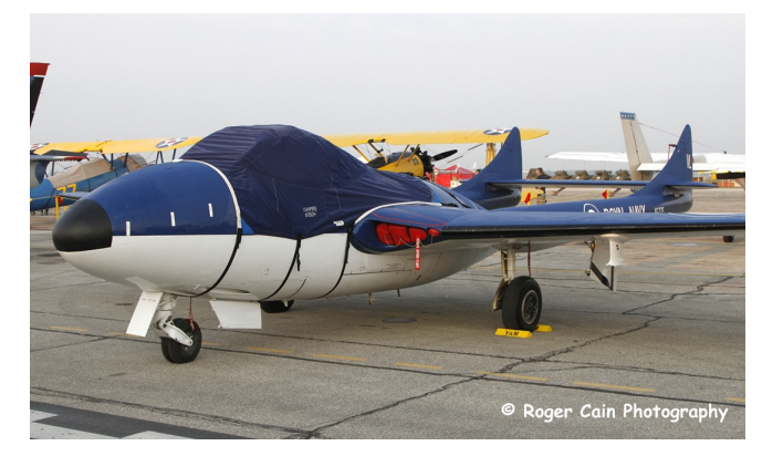
DeHavilland Vampire Canopy Cover, Engine Plugs