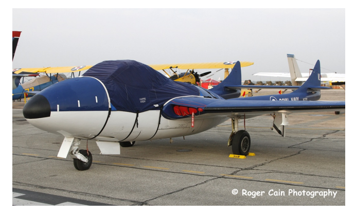
DeHavilland Vampire Canopy Cover, Engine Plugs