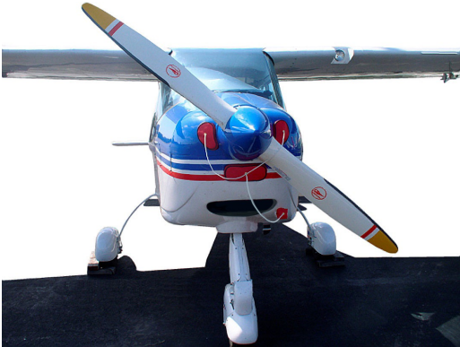
Tecnam Bravo Engine Plugs