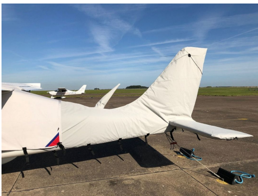
Tecnam P2010 Wing, Empennage & Prop Covers Tecnam P2008 Empennage Cover (Tailboom, Vertical & Horiz Stabilizers), All Year Use