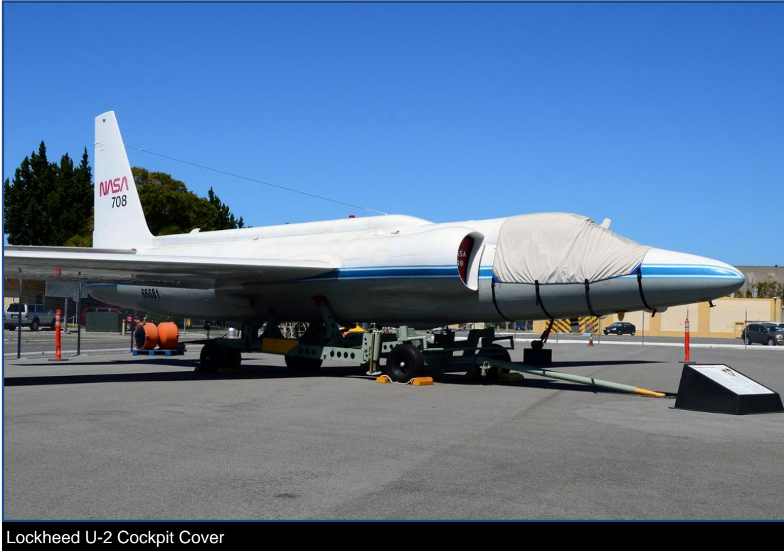
Lockheed U-2 Cockpit Cover