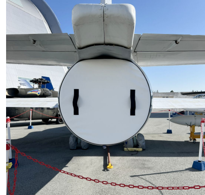
Lockheed U-2 Exhaust Plug, test fit plug