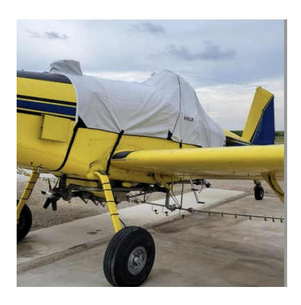
Air Tractor Inc AT-802A Canopy/Hopper Cover