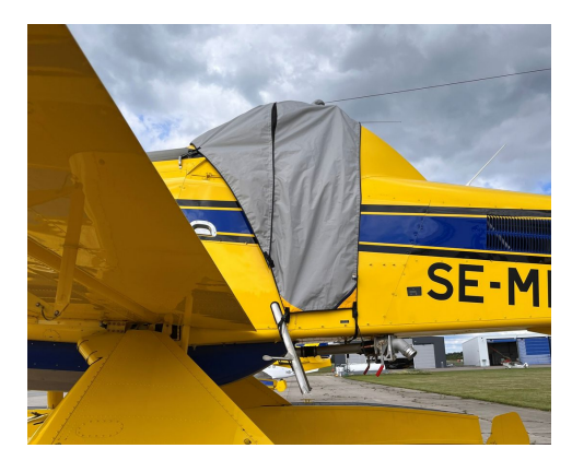
Air Tractor Light Weight Canopy Cover

Travel Covers are made with Silver Solution-Dyed Polyester fabric and only lined over the windshield to save weight. The material is lightweight and more compact for easy stowage in the aircraft. The polyester material is water resistant, but only intended for occasional use outside. We also have an ultra lightweight material available for fitted hangar dust covers. For daily outdoor use, the non-travel Sunbrella Cover is the best choice.