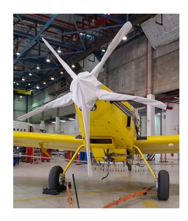
Air Tractor 5-Blade Prop Cover