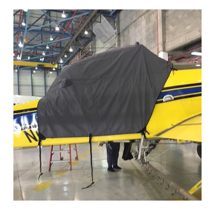
Air Tractor AT-802F Canopy Cover

This cover type is made from Silver Acrylic Sunbrella canvas and is 100% lined with a soft and smooth microfiber. Bruce's Custom Covers developed this material combination especially for aircraft protection. The outer material is medium weight and treated for water resistance, UV resistance and anti-static buildup. The inner lining is a very soft and smooth microfiber to prevent scratching. The material is very reflective, and tests show that the cabin interior temperature can be reduced to near-ambient temperature on the hottest of days. It is water, ice and snow repellent, yet breathable to allow moisture to escape from between the cover and the aircraft surface.