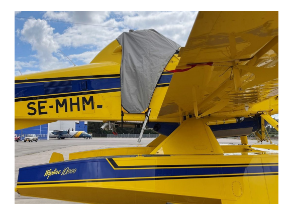
Air Tractor Light Weight Canopy Cover