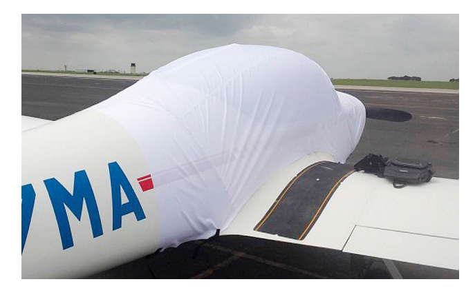
Taifun 17E Canopy/Engine Cover, test fit cover