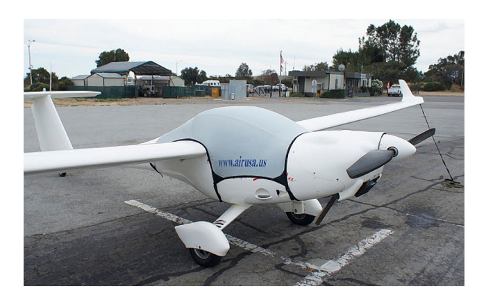
Lambada Travel Canopy Cover