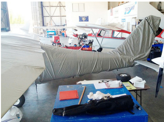
Tecnam Twin Canopy/Nose, Empennage, Wing/Engine, & Propellor/Spinner Covers Tecnam Twin Wing & Empennage Covers