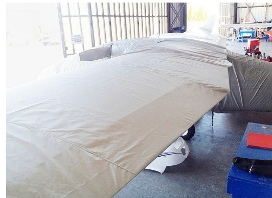
Tecnam Twin Canopy/Nose, Empennage, Wing/Engine, & Propellor/Spinner Covers