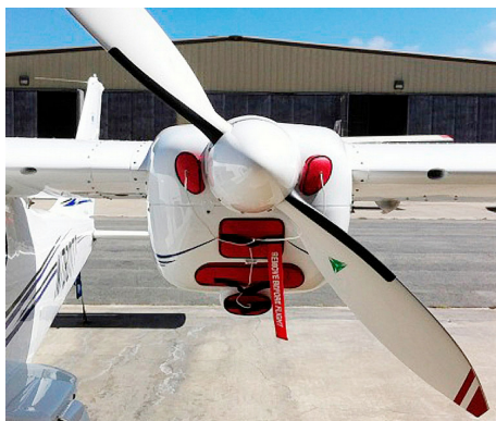
Tecnam P2006T Engine Plugs

Engine Inlet Plugs are custom fit for your Tecnam P2006T Twin intakes, made with heavy-duty vinyl material, and stuffed with a single block of sculpted urethane foam. Each plug has a zipper that allows the foam to be removed and dried if necessary. Engine plugs have warning flags that are visible from the cockpit or 'remove before flight' streamers sewn onto the face of the plugs. Most plugs are imprinted with the aircraft registration number in black for an extra charge. Storage bag NOT included. Engine plugs may be inserted after flight when the engine is still warm. Engine Inlet Plugs are commonly referred to as Cowl Plugs, Intake Plugs, Cowl Blocks, Engine Blocks, and Engine Bungs.