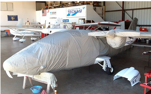
Tecnam Twin Canopy/Nose, Empennage, Wing/Engine, & Propellor/Spinner Covers

This cover type is made from Silver Acrylic Sunbrella canvas and is 100% lined with a soft and smooth microfiber. Bruce's Custom Covers developed this material combination especially for aircraft protection. The outer material is medium weight and treated for water resistance, UV resistance and anti-static buildup. The inner lining is a very soft and smooth microfiber to prevent scratching. The material is very reflective, and tests show that the cabin interior temperature can be reduced to near-ambient temperature on the hottest of days. It is water, ice and snow repellent, yet breathable to allow moisture to escape from between the cover and the aircraft surface.