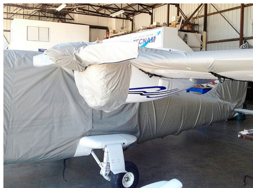
Tecnam Twin Canopy/Nose, Empennage, Wing/Engine, & Propellor/Spinner Covers

This cover type is made from Silver Acrylic Sunbrella canvas and is 100% lined with a soft and smooth microfiber. Bruce's Custom Covers developed this material combination especially for aircraft protection. The outer material is medium weight and treated for water resistance, UV resistance and anti-static buildup. The inner lining is a very soft and smooth microfiber to prevent scratching. The material is very reflective, and tests show that the cabin interior temperature can be reduced to near-ambient temperature on the hottest of days. It is water, ice and snow repellent, yet breathable to allow moisture to escape from between the cover and the aircraft surface.