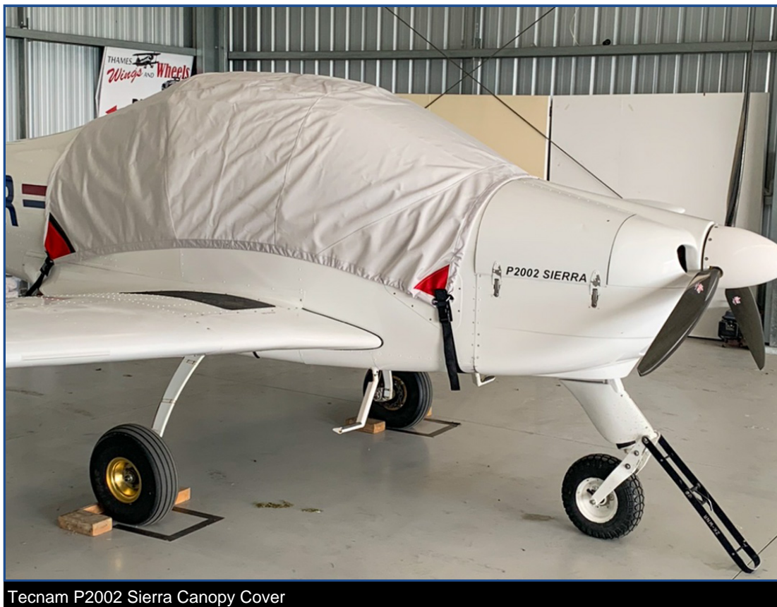
Tecnam P2002 Sierra Canopy Cover