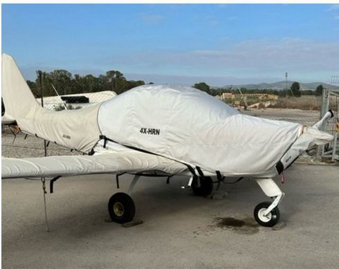
Tecnam P2008 Empennage Cover (Tailboom, Vertical & Horiz Stabilizers), All Year Use Tecnam Sierra Complete Cover Set