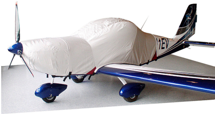
Evektor Sportstar Extended Canopy/Engine Cover