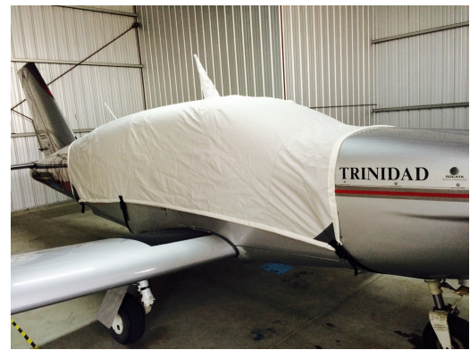
Trinidad Canopy Cover