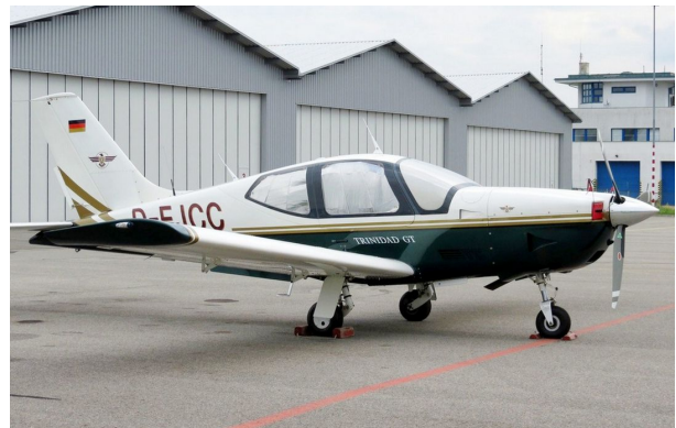
Socata Tobago TB20 Heatshields