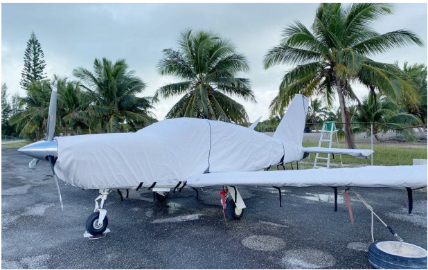
Socata Trinidad Full Cover Set