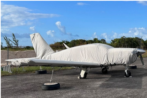
Socata TB-20 Trinidad Complete Cover Set