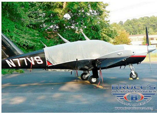
Socata TB20 Canopy Cover