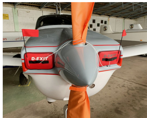
Socata TB-20 Engine Plugs