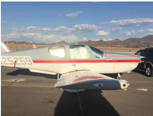
Socata TB-10 Cabin HeatShields

Windshield Heatshields are interior sunshades for an aircraft's front windshield. The product is a unique composite of closed-cell foam with a silver mylar finish. The semi-rigid design is stiff enough to stand along the inside of the windshield using sun visors or window framing. It folds up flat and easily stores in the included storage sleeve. Some designs may require velcro and suction cups or split right and left sides. A Heatshield is an excellent short-term remedy for cockpit overheating. An external fabric cover is far more effective and practical for long-term protection.