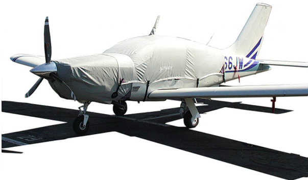
Canopy Cover & Engine Cover