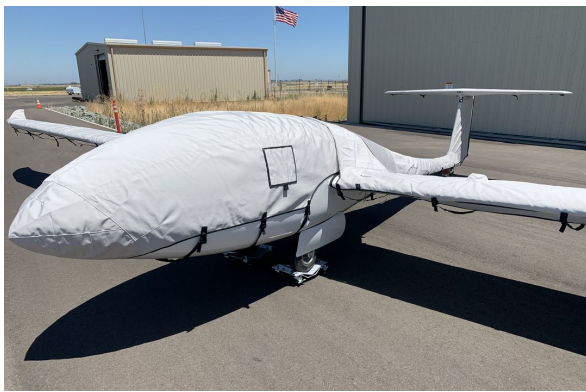
Pipistrel Taurus & Electro Canopy/Nose Cover, All Year Use