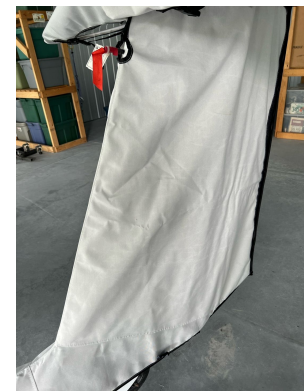
Pipistrel Taurus Complete Cover Set