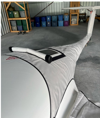
Pipistrel Taurus Complete Cover Set