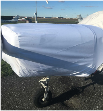
Slingsby T-67C Firefly Engine Cover, test fit cover

This cover type is made from Silver Acrylic Sunbrella canvas and is 100% lined with a soft and smooth microfiber. Bruce's Custom Covers developed this material combination especially for aircraft protection. The outer material is medium weight and treated for water resistance, UV resistance and anti-static buildup. The inner lining is a very soft and smooth microfiber to prevent scratching. The material is very reflective, and tests show that the cabin interior temperature can be reduced to near-ambient temperature on the hottest of days. It is water, ice and snow repellent, yet breathable to allow moisture to escape from between the cover and the aircraft surface.