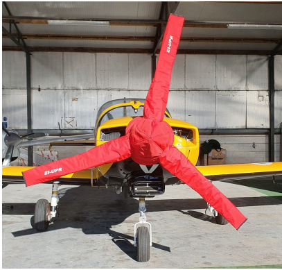
Slingsby T-67 Firefly Insulated Propellor/Spinner Cover