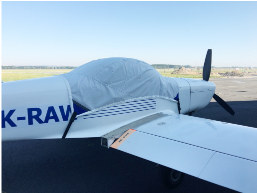
Slingsby T-67 Firefly Canopy Cover