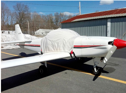
Slingsby T-67 Firefly Extended Canopy Cover

This cover type is made from Silver Acrylic Sunbrella canvas and is 100% lined with a soft and smooth microfiber. Bruce's Custom Covers developed this material combination especially for aircraft protection. The outer material is medium weight and treated for water resistance, UV resistance and anti-static buildup. The inner lining is a very soft and smooth microfiber to prevent scratching. The material is very reflective, and tests show that the cabin interior temperature can be reduced to near-ambient temperature on the hottest of days. It is water, ice and snow repellent, yet breathable to allow moisture to escape from between the cover and the aircraft surface.