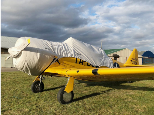
North American T6 Canopy Cover with 30" fwd ext (multi piece back glass), Engine & Prop Covers

This cover type is made from Silver Acrylic Sunbrella canvas and is 100% lined with a soft and smooth microfiber. Bruce's Custom Covers developed this material combination especially for aircraft protection. The outer material is medium weight and treated for water resistance, UV resistance and anti-static buildup. The inner lining is a very soft and smooth microfiber to prevent scratching. The material is very reflective, and tests show that the cabin interior temperature can be reduced to near-ambient temperature on the hottest of days. It is water, ice and snow repellent, yet breathable to allow moisture to escape from between the cover and the aircraft surface.