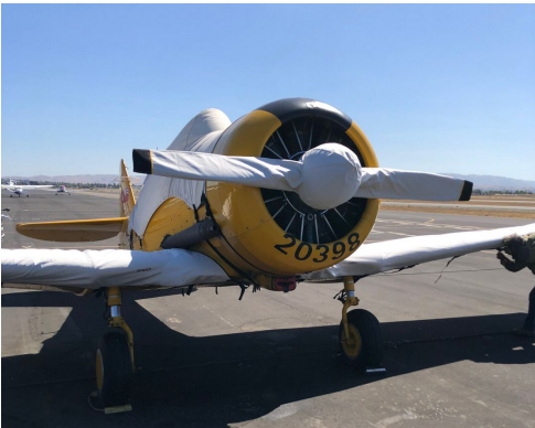
North American Harvard T6 Canopy, Prop & Wing Covers

This cover type is made from Silver Acrylic Sunbrella canvas and is 100% lined with a soft and smooth microfiber. Bruce's Custom Covers developed this material combination especially for aircraft protection. The outer material is medium weight and treated for water resistance, UV resistance and anti-static buildup. The inner lining is a very soft and smooth microfiber to prevent scratching. The material is very reflective, and tests show that the cabin interior temperature can be reduced to near-ambient temperature on the hottest of days. It is water, ice and snow repellent, yet breathable to allow moisture to escape from between the cover and the aircraft surface.