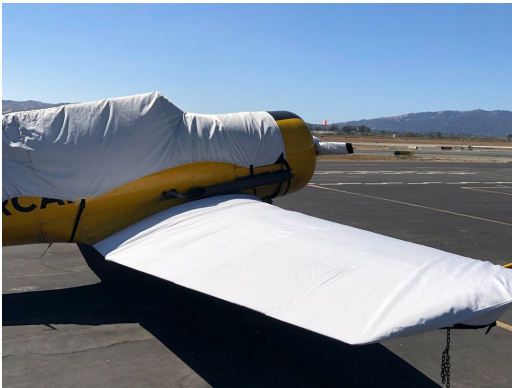
North American Harvard T6 Canopy & Wing Covers

WINTER USE MATERIAL - Made with Solution-Dyed Polyester fabric, this option is intended for seasonal use to aid in deicing, rain mitigation, or for occasional travel. The material is lighter and more compact, but more susceptible to UV damage and may have a shorter useful life if used continuously outside than the all-year use material.