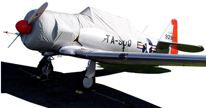
Canopy, Engine & Pitot Cover