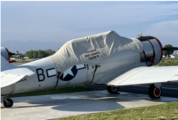
North American T6 Canopy Cover w/30" fwd extension