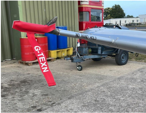
T6 Harvard Pitot Cover, shark fin type

Engine Inlet Plugs are custom fit for your North American T6, SNJ, Harvard intakes, made with heavy-duty vinyl material, and stuffed with a single block of sculpted urethane foam. Each plug has a zipper that allows the foam to be removed and dried if necessary. Engine plugs have warning flags that are visible from the cockpit or 'remove before flight' streamers sewn onto the face of the plugs. Most plugs are imprinted with the aircraft registration number in black for an extra charge. Storage bag NOT included. Engine plugs may be inserted after flight when the engine is still warm. Engine Inlet Plugs are commonly referred to as Cowl Plugs, Intake Plugs, Cowl Blocks, Engine Blocks, and Engine Bungs.