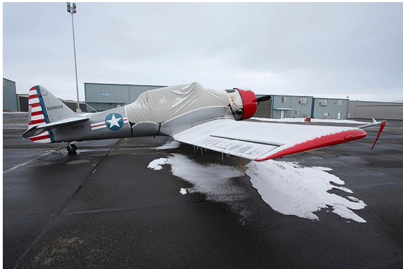
North American T6 Canopy Cover

Travel Covers are made with Silver Solution-Dyed Polyester fabric and only lined over the windshield to save weight. The material is lightweight and more compact for easy stowage in the aircraft. The polyester material is water resistant, but only intended for occasional use outside. We also have an ultra lightweight material available for fitted hangar dust covers. For daily outdoor use, the non-travel Sunbrella Cover is the best choice.