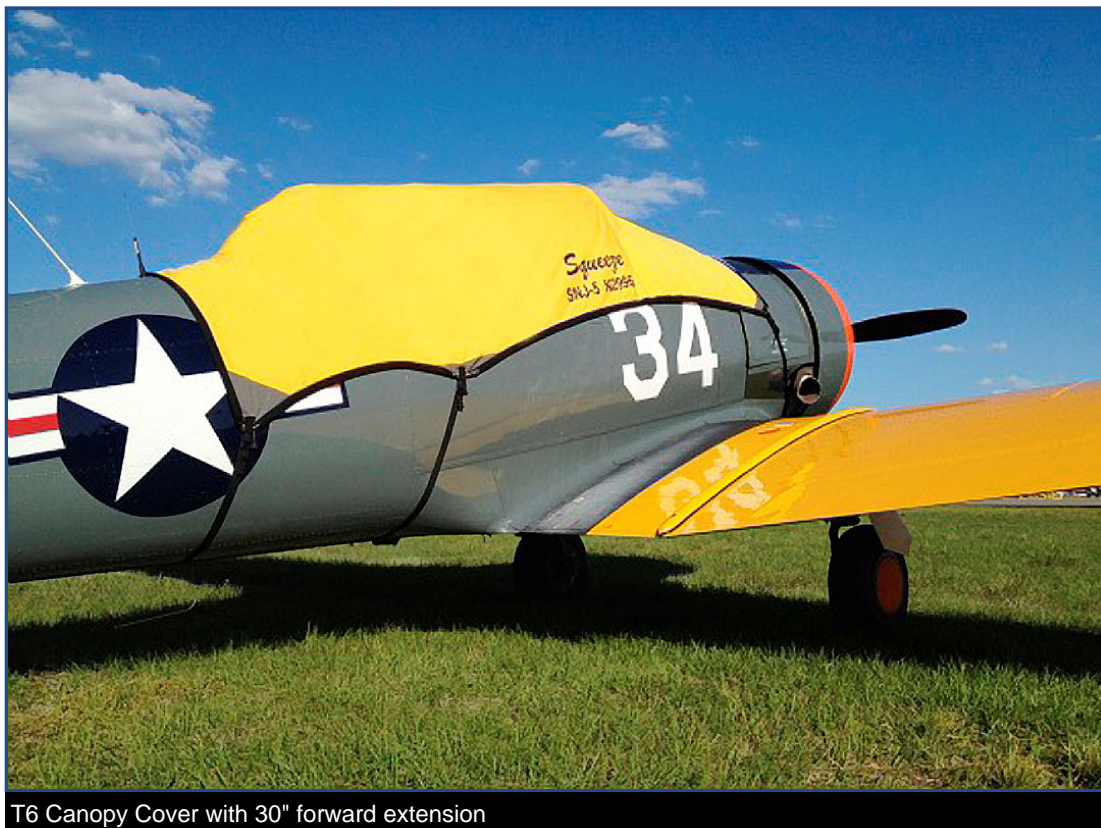
T6 Canopy Cover with 30" forward extension