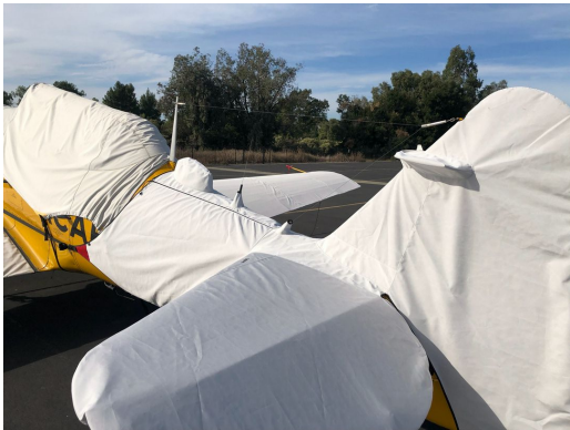
North American T6 Empennage Cover