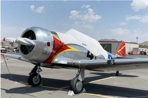
North American T6 Canopy & Prop Covers