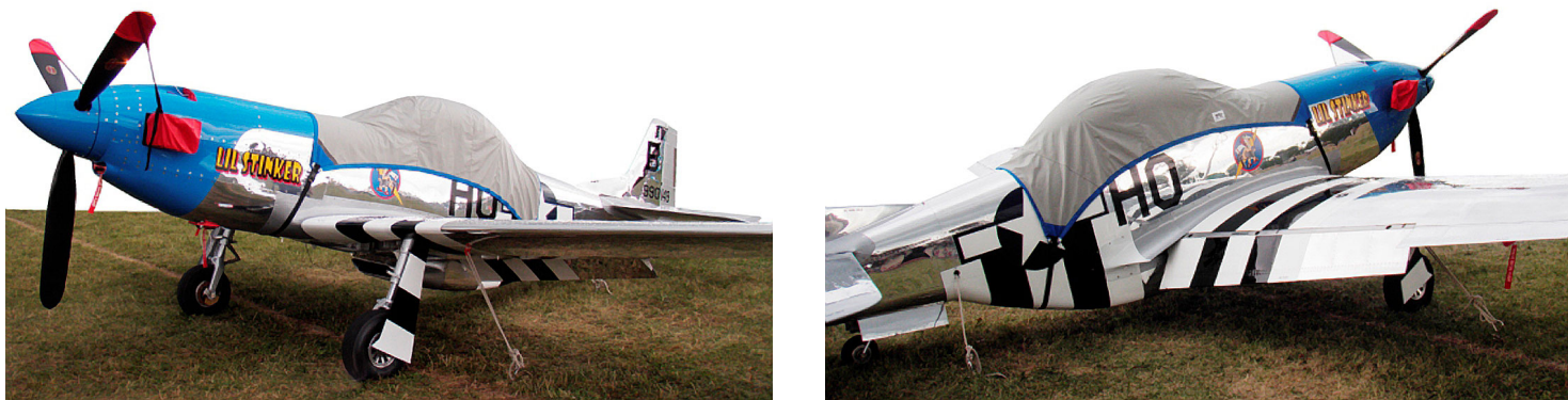
Stewart Mustang Canopy Cover, Prop Tie Downs & Intake Plugs Stewart Mustang Canopy Cover, Prop Tie Downs & Intake Plugs

lightweight and more compact for easy stowage in the aircraft. The polyester material is water resistant, but only intended for occasional use outside. We also have an ultra lightweight material available for fitted hangar dust covers. For daily outdoor use, the non-travel Sunbrella Cover is the best choice.