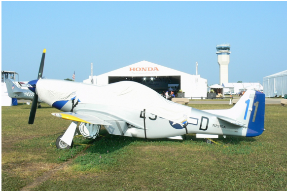
Thunder Mustang Canopy & Engine Cover