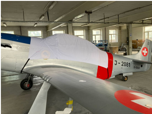
Scalewings SW-51 Mustang Canopy & Engine Covers, test fit covers Scalewings SW-51 Mustang Canopy Cover, test fit cover