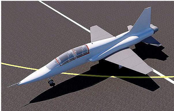
T-38 Talon Wing and Horizontal Stabilizer Covers (3D Rendering)