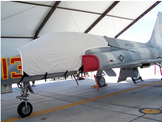
Northrup F5 Talon Canopy Cover