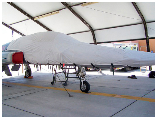
Northup F5 Talon Canopy Cover