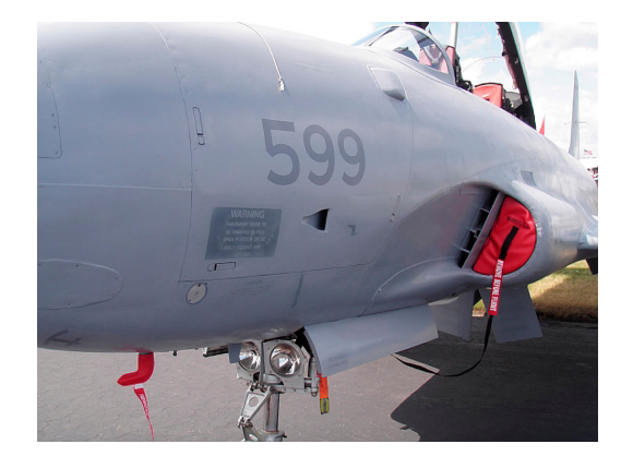
Engine Inlet Plugs and Pitot Cover