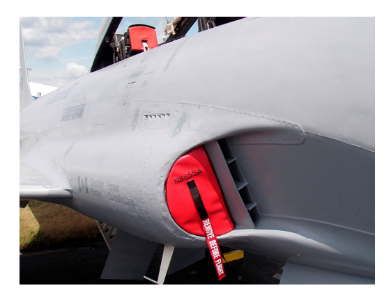
T33 Intake Plug

The Engine Inlet Plugs are custom fit for your Lockheed T-33 Shooting Star intakes, made with heavy-duty vinyl material, and stuffed with a single block of sculpted urethane foam. Each plug has a zipper that allows the foam to be removed and dried if necessary. Engine plugs have 'remove before flight' streamers sewn onto the face of the plugs. Most plugs are imprinted with the aircraft registration number in black for an extra charge. Storage bag NOT included. Engine plugs may be inserted after flight when the engine is still warm. Engine Inlet Plugs are commonly referred to as Cowl Plugs, Intake Plugs, Cowl Blocks, Engine Blocks, and Engine Bungs.