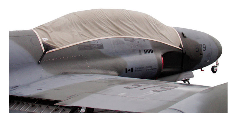
Lockheed T33 Canopy Cover