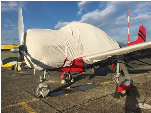
North American T28 Extended Canopy CoverT28 Engine Cover

This cover type is made from Silver Acrylic Sunbrella canvas and is 100% lined with a soft and smooth microfiber. Bruce's Custom Covers developed this material combination especially for aircraft protection. The outer material is medium weight and treated for water resistance, UV resistance and anti-static buildup. The inner lining is a very soft and smooth microfiber to prevent scratching. The material is very reflective, and tests show that the cabin interior temperature can be reduced to near-ambient temperature on the hottest of days. It is water, ice and snow repellent, yet breathable to allow moisture to escape from between the cover and the aircraft surface.