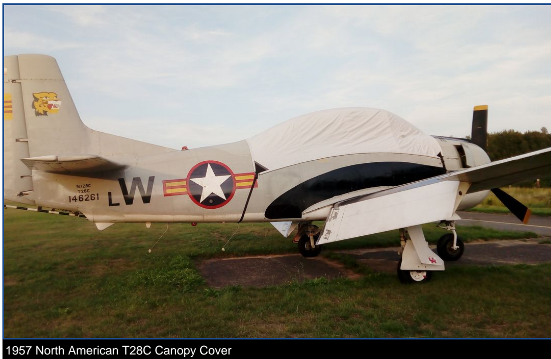
1957 North American T28C Canopy Cover