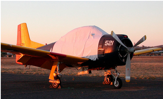
North American T-28 Extended Canopy Cover