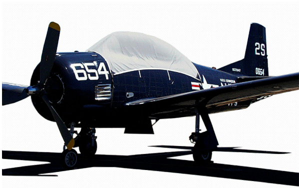
North American T28 Canopy Cover

Travel Covers are made with Silver Solution-Dyed Polyester fabric and only lined over the windshield to save weight. The material is lightweight and more compact for easy stowage in the aircraft. The polyester material is water resistant, but only intended for occasional use outside. We also have an ultra lightweight material available for fitted hangar dust covers. For daily outdoor use, the non-travel Sunbrella Cover is the best choice.