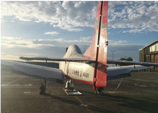
North American T28 Extended Canopy CoverT28 Engine Cover North American T28 Extended Canopy CoverT28 Wing Covers