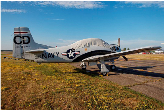
North American T-28 Canopy Cover

This cover type is made from Silver Acrylic Sunbrella canvas and is 100% lined with a soft and smooth microfiber. Bruce's Custom Covers developed this material combination especially for aircraft protection. The outer material is medium weight and treated for water resistance, UV resistance and anti-static buildup. The inner lining is a very soft and smooth microfiber to prevent scratching. The material is very reflective, and tests show that the cabin interior temperature can be reduced to near-ambient temperature on the hottest of days. It is water, ice and snow repellent, yet breathable to allow moisture to escape from between the cover and the aircraft surface.