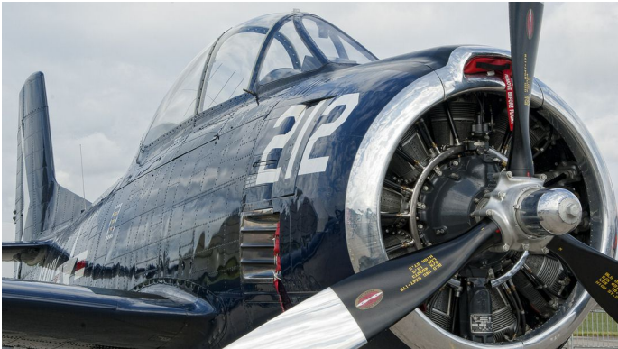
North American T28 Extended Canopy CoverT28 Trojan Carb. Air Inlet Plug