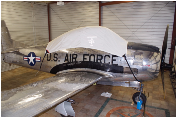
North American T-28 Canopy Cover