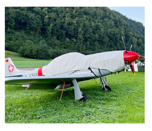
Stewart S-51 Canopy & Engine Covers