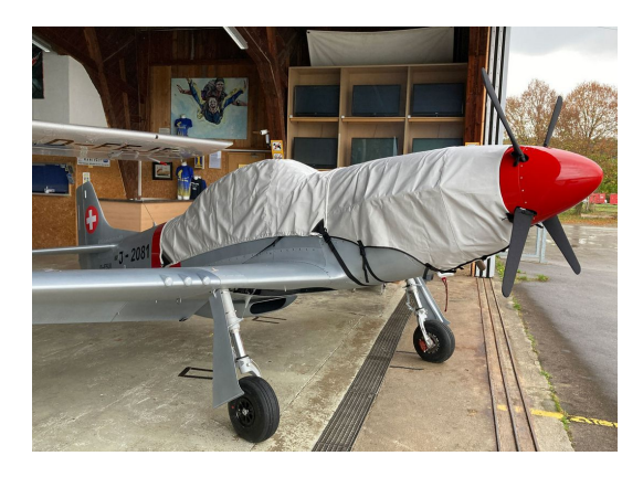
SW-51 Mustang Canopy & Engine Covers

This cover type is made from Silver Acrylic Sunbrella canvas and is 100% lined with a soft and smooth microfiber. Bruce's Custom Covers developed this material combination especially for aircraft protection. The outer material is medium weight and treated for water resistance, UV resistance and anti-static buildup. The inner lining is a very soft and smooth microfiber to prevent scratching. The material is very reflective, and tests show that the cabin interior temperature can be reduced to near-ambient temperature on the hottest of days. It is water, ice and snow repellent, yet breathable to allow moisture to escape from between the cover and the aircraft surface.