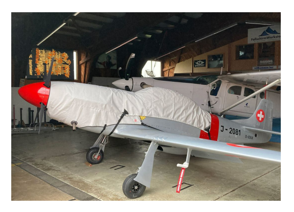
SW-51 Mustang Canopy & Engine Covers