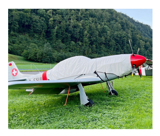
Stewart S-51 Canopy & Engine Covers

Covers developed this material combination especially for aircraft protection. The outer material is medium weight and treated for water resistance, UV resistance and anti-static buildup. The inner lining is a very soft and smooth microfiber to prevent scratching. The material is very reflective, and tests show that the cabin interior temperature can be reduced to near-ambient temperature on the hottest of days. It is water, ice and snow repellent, yet breathable to allow moisture to escape from between the cover and the aircraft surface.