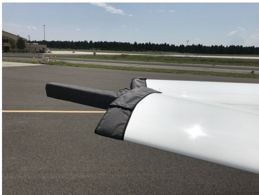
STEMME S10-VT WING FOLD COVERS

WINTER USE MATERIAL - Made with Solution-Dyed Polyester fabric, this option is intended for seasonal use to aid in deicing, rain mitigation, or for occasional travel. The material is lighter and more compact, but more susceptible to UV damage and may have a shorter useful life if used continuously outside than the all-year use material.