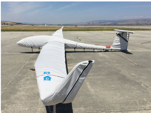
Schempp-Hirth Discus 2B Full Cover Set