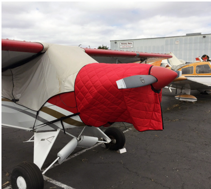
FOR INTERIOR USE. Cub Crafters CC-11 Insulated Hangar Blanket, available in Red or Silver