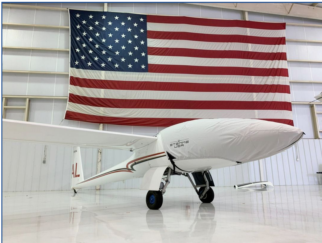
Stemme S-12 Canopy/Nose Cover