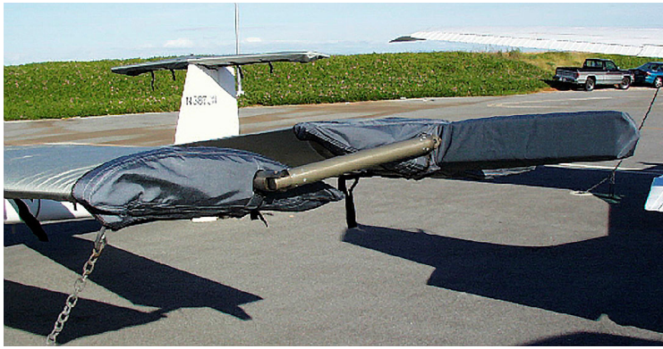
End Cap Covers are used when wing are in folded position.