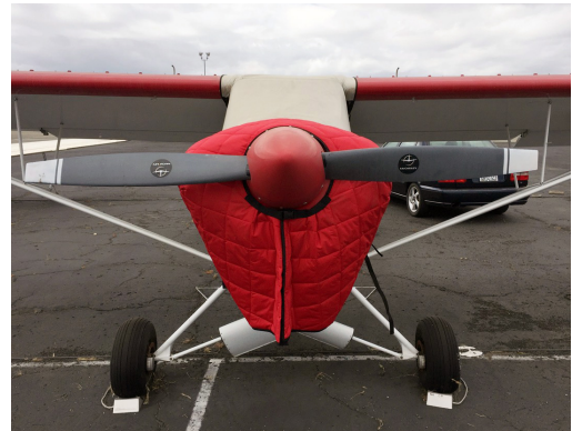
FOR INTERIOR USE. Cub Crafters CC-11 Insulated Hangar Blanket, available in Red or Silver