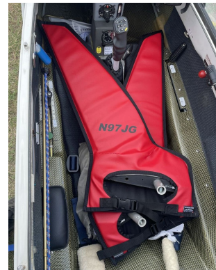
Schempp-Hirth Ventus-2B winglet/wingtip pads