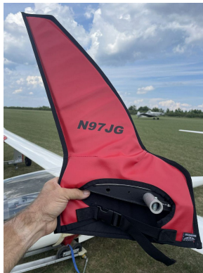
Schempp-Hirth Ventus-2B winglet/wingtip pads

Designed to prevent damage to the wingtip in crowded hangars or high traffic areas, these products are made of bright red Naugahyde and thickly padded with a sandwich of closed cell foam. Protects delicate winglets, casters and their housings, and soft finishes.