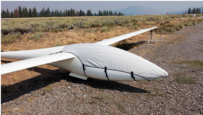
ASW-20C Canopy/Nose Cover