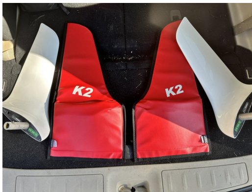
Discus CS Wingtip Pads (Set of 2)

Designed to prevent damage to the aircraft extremities in crowded hangars, these products are made of bright red Naugahyde and thickly padded with a sandwich of closed cell foam. Nowadays they are also made using bright read Neoprene padded laminated (think: wetsuit material).