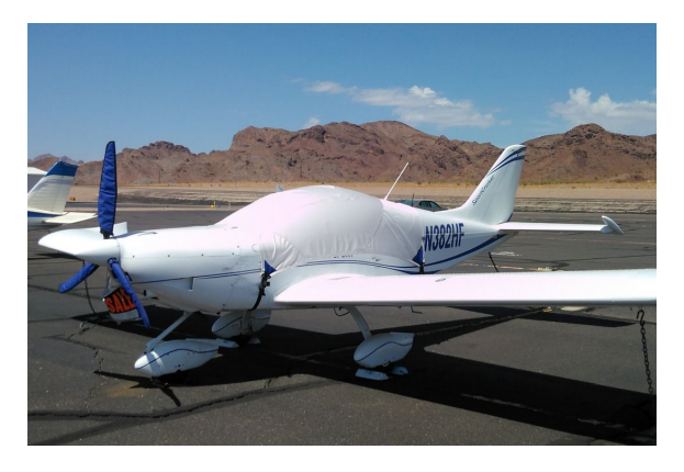
Czech Aircraft Works Sport Cruiser

This cover type is made from Silver Acrylic Sunbrella canvas and is 100% lined with a soft and smooth microfiber. Bruce's Custom Covers developed this material combination especially for aircraft protection. The outer material is medium weight and treated for water resistance, UV resistance and anti-static buildup. The inner lining is a very soft and smooth microfiber to prevent scratching. The material is very reflective, and tests show that the cabin interior temperature can be reduced to near-ambient temperature on the hottest of days. It is water, ice and snow repellent, yet breathable to allow moisture to escape from between the cover and the aircraft surface.