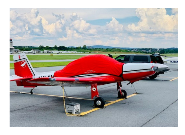
Micco SP20 Canopy Cover

The Micco SP20 Canopy/Engine Cover is a one-piece cover (100% lined with microfiber) that is a combination of the Canopy Cover and Engine Cover. This cover will enclose the engine cowl and will extend aft to cover all of the windows. This cover type is made from Silver Acrylic Sunbrella canvas and is 100% lined with a soft and smooth microfiber. Bruce's Custom Covers developed this material combination especially for aircraft protection. The outer material is medium weight and treated for water resistance, UV resistance and anti-static buildup. The inner lining is a very soft and smooth microfiber to prevent scratching. The material is very reflective, and tests show that the cabin interior temperature can be reduced to near-ambient temperature on the hottest of days. It is water, ice and snow repellent, yet breathable to allow moisture to escape from between the cover and the aircraft surface.