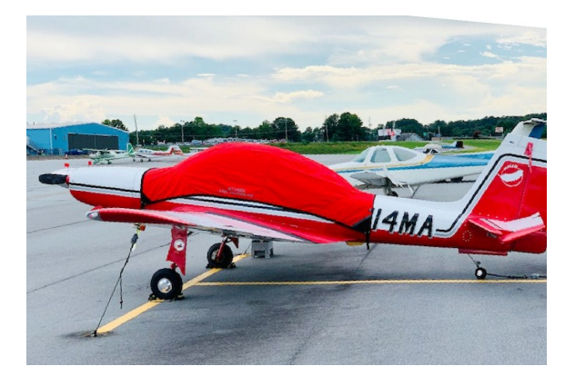
Micco SP20 Canopy Cover