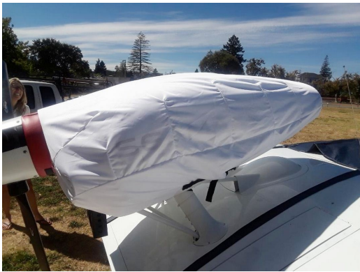
Seamax M22 Engine Cover, test fit cover

Engine Covers will cinch around or behind the spinner, cover the entire engine cowl area including the engine air cooling and induction air inlets, and fastens together with Velcro beneath the spinner down the front of the cowling. The Engine Cover is attached with a belly strap aft of the firewall, and can Velcro to the Canopy Cover. Engine Covers are normally made from Solution-Dyed Polyester or Acrylic Sunbrella . An Insulated version of the engine cover can be made with a thicker, quilted, and water-repellent material. The Insulated Engine Cover works well in cold climates to help with engine preheating.