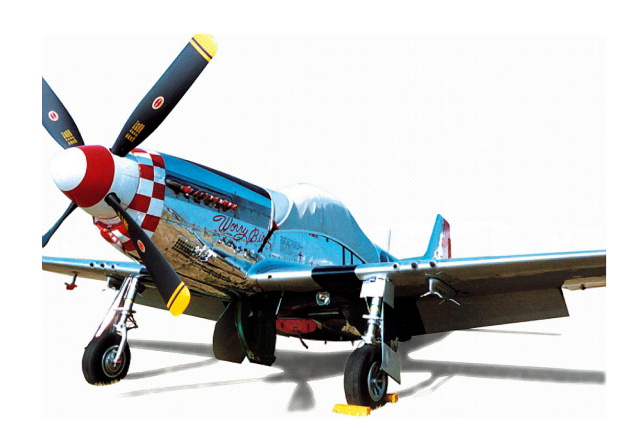
Canopy Cover, Belly & Chin Scoop Plugs