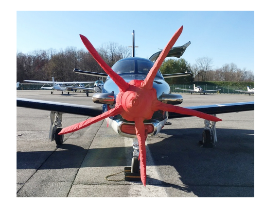
Socata TBM Insulated 5-Blade Prop/Spinner Cover

This cover type is made from Silver Acrylic Sunbrella canvas and is 100% lined with a soft and smooth microfiber. Bruce's Custom Covers developed this material combination especially for aircraft protection. The outer material is medium weight and treated for water resistance, UV resistance and anti-static buildup. The inner lining is a very soft and smooth microfiber to prevent scratching. The material is very reflective, and tests show that the cabin interior temperature can be reduced to near-ambient temperature on the hottest of days. It is water, ice and snow repellent, yet breathable to allow moisture to escape from between the cover and the aircraft surface.