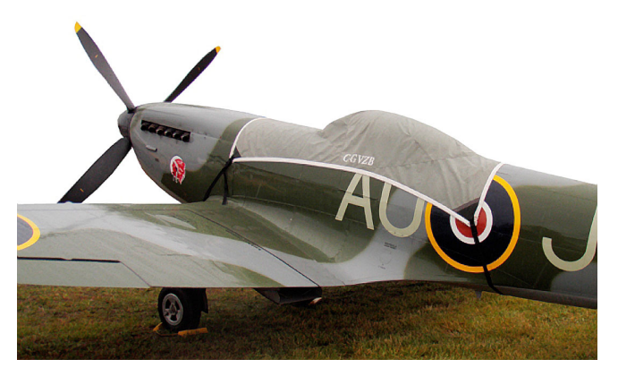
Supermarine Spitfire Mark 16 Canopy Cover