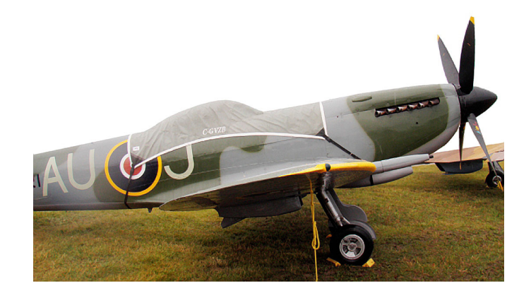
Supermarine Spitfire Mark 16 Canopy Cover