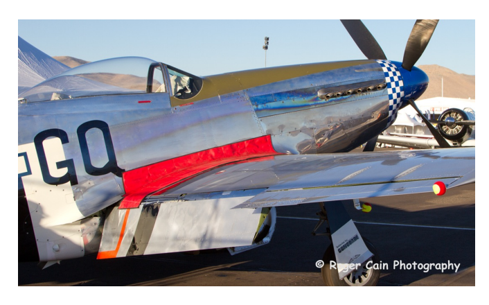
North American P-51 Wing Walk Pad