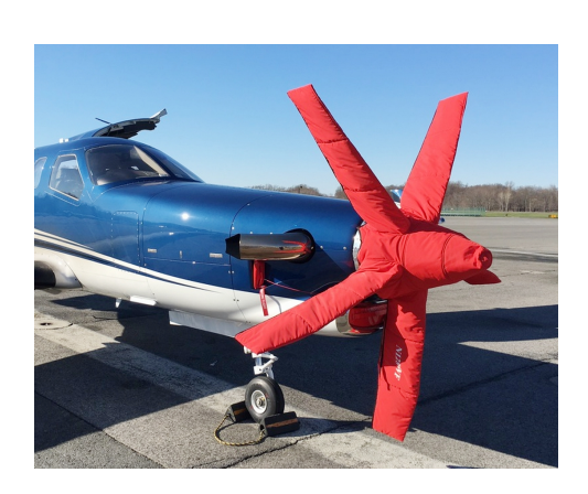
Socata TBM Insulated 5-Blade Prop/Spinner Cover