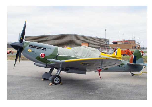
Supermarine Spitfire Mk 14 Canopy Cover

Travel Covers are made with Silver Solution-Dyed Polyester fabric and only lined over the windshield to save weight. The material is lightweight and more compact for easy stowage in the aircraft. The polyester material is water resistant, but only intended for occasional use outside. We also have an ultra lightweight material available for fitted hangar dust covers. For daily outdoor use, the non-travel Sunbrella Cover is the best choice.