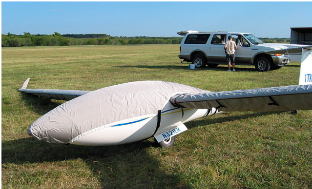
Canopy/Nose Cover, Wings and Horizontal Stab Covers