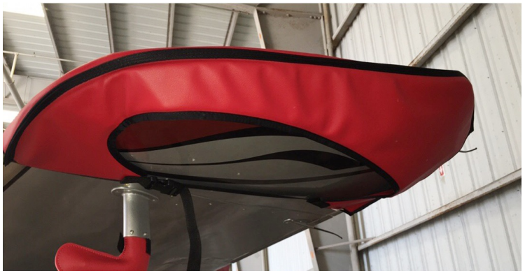
Cirrus SR-22 Wingtip Pad (also available for the Horiz. Stab.