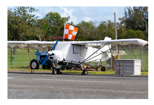
Best Off Skyranger Canopy, Wings & Empennage Covers