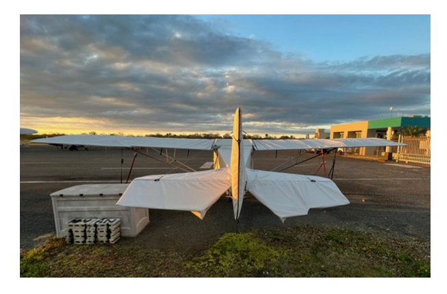
Best Off Skyranger Wing & Empennage Covers

WINTER USE MATERIAL - Made with Solution-Dyed Polyester fabric, this option is intended for seasonal use to aid in deicing, rain mitigation, or for occasional travel. The material is lighter and more compact, but more susceptible to UV damage and may have a shorter useful life if used continuously outside than the all-year use material.