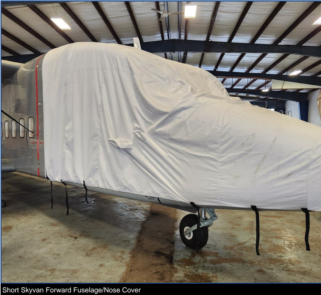
Short Skyvan Forward Fuselage/Nose Cover