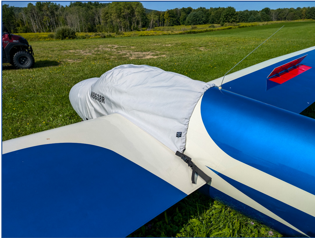
Schweizer 1-23H-15 Canopy/Nose Cover