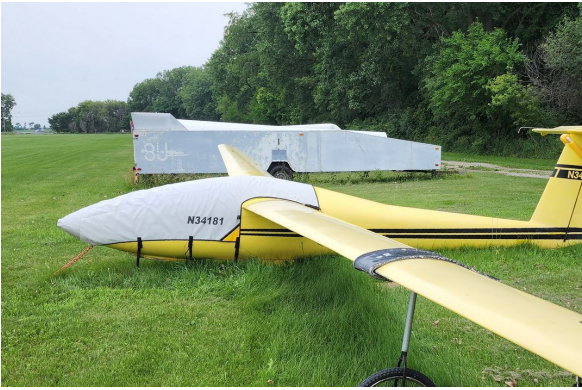
Schweizer SGS 1-35 Canopy/Nose Cover

the hottest of days. It is water, ice and snow repellent, yet breathable to allow moisture to escape from between the cover and the aircraft surface.