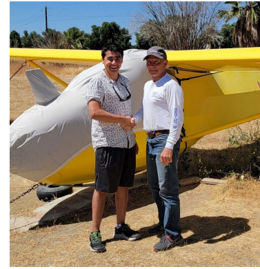
Schweizer 2-33 Canopy/Nose Cover