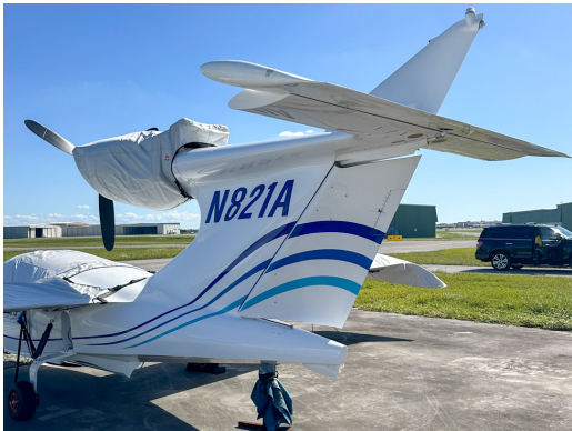
Seawind Seawind 300C & 3000 Engine Cover

This cover type is made from Silver Acrylic Sunbrella canvas and is 100% lined with a soft and smooth microfiber. Bruce's Custom Covers developed this material combination especially for aircraft protection. The outer material is medium weight and treated for water resistance, UV resistance and anti-static buildup. The inner lining is a very soft and smooth microfiber to prevent scratching. The material is very reflective, and tests show that the cabin interior temperature can be reduced to near-ambient temperature on the hottest of days. It is water, ice and snow repellent, yet breathable to allow moisture to escape from between the cover and the aircraft surface.