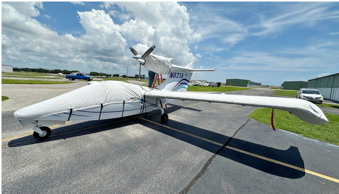
Seawind 3000 Canopy/Nose, Wing & Engine Covers