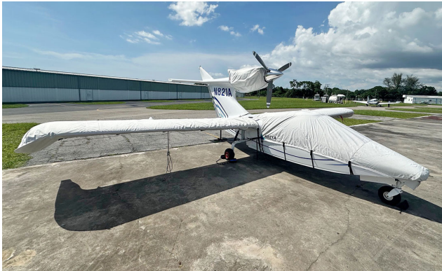
Seawind 3000 Canopy/Nose, Wing & Engine Covers

This cover type is made from Silver Acrylic Sunbrella canvas and is 100% lined with a soft and smooth microfiber. Bruce's Custom Covers developed this material combination especially for aircraft protection. The outer material is medium weight and treated for water resistance, UV resistance and anti-static buildup. The inner lining is a very soft and smooth microfiber to prevent scratching. The material is very reflective, and tests show that the cabin interior temperature can be reduced to near-ambient temperature on the hottest of days. It is water, ice and snow repellent, yet breathable to allow moisture to escape from between the cover and the aircraft surface.