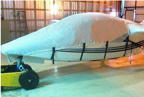
Seawind Canopy/Nose Cover