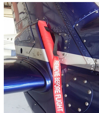
S76 Tail Wedge Plug