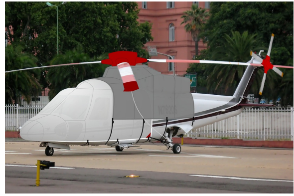
S76 Forward Fuselage, Engine, Main & Tail Rotor Hub Covers (illustration)