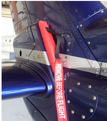
S76 Tail Wedge Plug

The Engine Inlet Plugs are custom fit for your Sikorsky S76 (All Models) intakes, made with heavy-duty vinyl material, and stuffed with a single block of sculpted urethane foam. Each plug has a zipper that allows the foam to be removed and dried if necessary. Engine plugs have 'Remove Before Flight' streamers sewn onto the face of the plugs. Most plugs are imprinted with the aircraft registration number in black for an extra charge. Storage bag NOT included. Engine plugs may be inserted after flight when the engine is still warm. Engine Inlet Plugs are commonly referred to as Cowl Plugs, Intake Plugs, Cowl Blocks, Engine Blocks, and Engine Bungs.