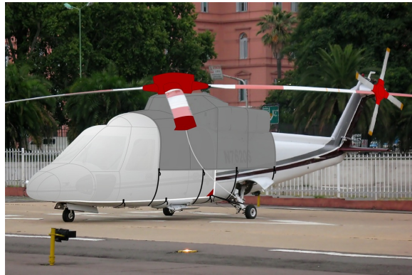
S76 Forward Fuselage, Engine, Main & Tail Rotor Hub Covers (illustration)