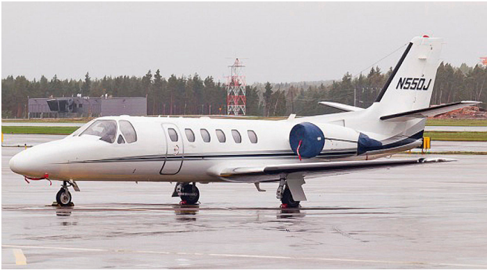
Cessna Citation Bravo Engine Covers and Pitot Covers sets

and dried if necessary. Engine plugs have 'remove before flight' streamers sewn onto the face of the plugs. Most plugs are imprinted with the aircraft registration number in black. Engine plugs may be inserted after flight when the engine is still warm. Engine Inlet Plugs are commonly referred to as Cowl Plugs, Intake Plugs, Cowl Blocks, Engine Blocks, and Engine Bungs.