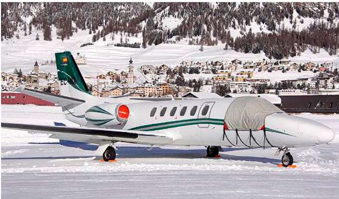
Cessna Citation S2 Cockpit Cover, Intake Covers & Exhaust Plugs