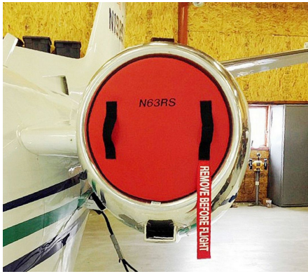
Cessna Citation S-550 Intake Plugs