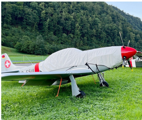
Stewart S-51 Canopy & Engine Covers

Covers developed this material combination especially for aircraft protection. The outer material is medium weight and treated for water resistance, UV resistance and anti-static buildup. The inner lining is a very soft and smooth microfiber to prevent scratching. The material is very reflective, and tests show that the cabin interior temperature can be reduced to near-ambient temperature on the hottest of days. It is water, ice and snow repellent, yet breathable to allow moisture to escape from between the cover and the aircraft surface.