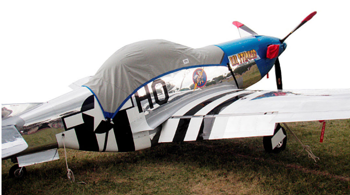
Stewart Mustang Canopy Cover, Prop Tie Downs & Intake Plugs