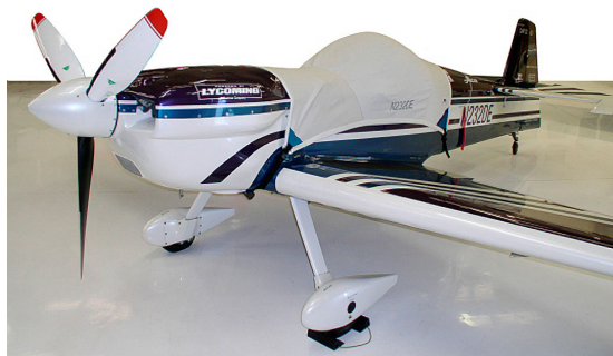
Cap 232 Canopy Cover