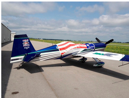
Extra 300SC Canopy Cover with custom artwork