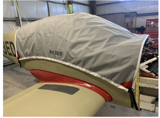
Swearingen SX300 Travel Weight Canopy Cover