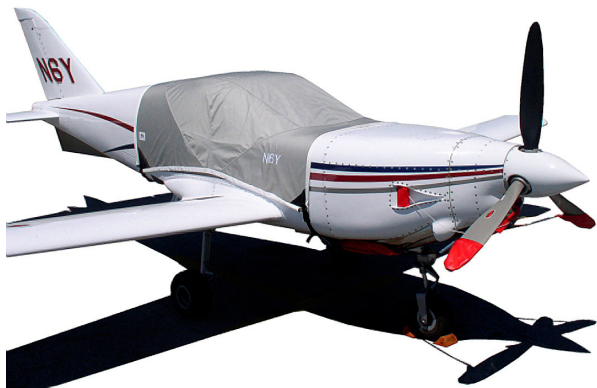
The Swearingen SX300 Canopy Cover, Engine Plugs & Prop Ties