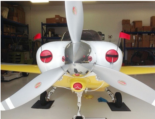
Swearingen SX300 Engine Inlet Plugs

Engine Inlet Plugs are custom fit for your Swearingen SX300 intakes, made with heavy-duty vinyl material, and stuffed with a single block of sculpted urethane foam. Each plug has a zipper that allows the foam to be removed and dried if necessary. Engine plugs have warning flags that are visible from the cockpit or 'remove before flight' streamers sewn onto the face of the plugs. Most plugs are imprinted with the aircraft registration number in black for an extra charge. Storage bag NOT included. Engine plugs may be inserted after flight when the engine is still warm. Engine Inlet Plugs are commonly referred to as Cowl Plugs, Intake Plugs, Cowl Blocks, Engine Blocks, and Engine Bungs.