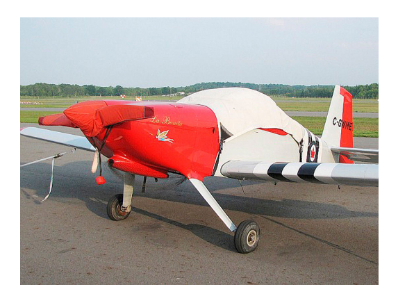
Van's RV-9 Propellor/Spinner Cover & Canopy Cover