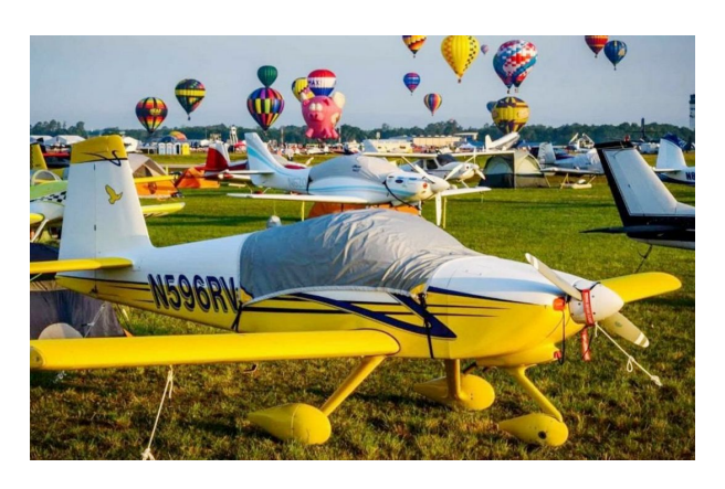
Vans's RV-9 Travel Weight Canopy Cover at Sun 'n Fun

occasional use outside. We also have an ultra lightweight material available for fitted hangar dust covers. For daily outdoor use, the non-travel Sunbrella Cover is the best choice.