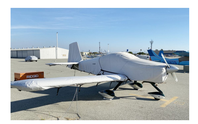
Van's RV-9A Extended Canopy/Engine, Wing & Empennage Covers

WINTER USE MATERIAL - Made with Solution-Dyed Polyester fabric, this option is intended for seasonal use to aid in deicing, rain mitigation, or for occasional travel. The material is lighter and more compact, but more susceptible to UV damage and may have a shorter useful life if used continuously outside than the all-year use material.