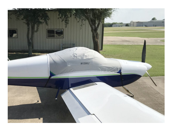
Van's RV-9A Travel Weight Canopy Cover