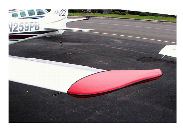
Cirrus SR-22 Wingtip Pad (also available for the Horiz. Stab.