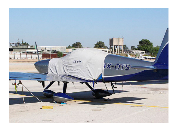
Van's RV-9A Extended Canopy Cover

This cover type is made from Silver Acrylic Sunbrella canvas and is 100% lined with a soft and smooth microfiber. Bruce's Custom Covers developed this material combination especially for aircraft protection. The outer material is medium weight and treated for water resistance, UV resistance and anti-static buildup. The inner lining is a very soft and smooth microfiber to prevent scratching. The material is very reflective, and tests show that the cabin interior temperature can be reduced to near-ambient temperature on the hottest of days. It is water, ice and snow repellent, yet breathable to allow moisture to escape from between the cover and the aircraft surface.