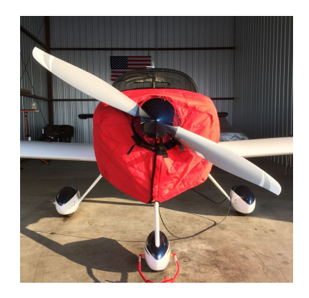
Van's RV-9A Insulated Engine Cover