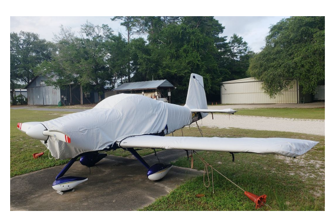
Van's RV-7A Cover Set