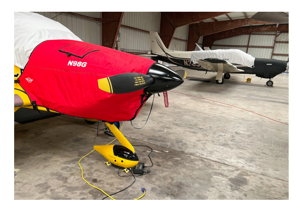
Van's Aircraft RV-7/7A Insulated Engine Cover