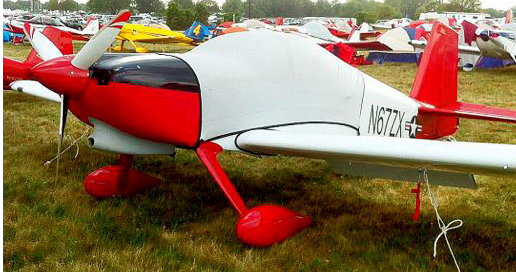
Light Weight Fitted Hangar Dust Cover

Travel Covers are made with Silver Solution-Dyed Polyester fabric and only lined over the windshield to save weight. The material is lightweight and more compact for easy stowage in the aircraft. The polyester material is water resistant, but only intended for occasional use outside. We also have an ultra lightweight material available for fitted hangar dust covers. For daily outdoor use, the non-travel Sunbrella Cover is the best choice.