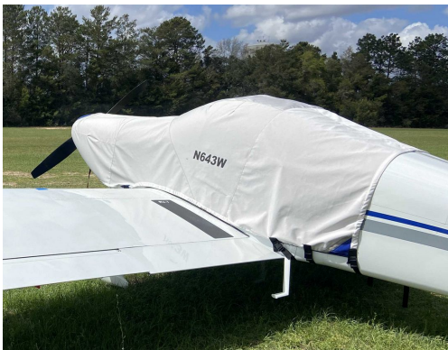
Van's RV-7 Extended Canopy/Engine Cover

This cover type is made from Silver Acrylic Sunbrella canvas and is 100% lined with a soft and smooth microfiber. Bruce's Custom Covers developed this material combination especially for aircraft protection. The outer material is medium weight and treated for water resistance, UV resistance and anti-static buildup. The inner lining is a very soft and smooth microfiber to prevent scratching. The material is very reflective, and tests show that the cabin interior temperature can be reduced to near-ambient temperature on the hottest of days. It is water, ice and snow repellent, yet breathable to allow moisture to escape from between the cover and the aircraft surface.