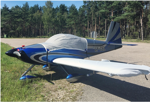
Van's RV-7/7A Travel and Wing Covers

WINTER USE MATERIAL - Made with Solution-Dyed Polyester fabric, this option is intended for seasonal use to aid in deicing, rain mitigation, or for occasional travel. The material is lighter and more compact, but more susceptible to UV damage and may have a shorter useful life if used continuously outside than the all-year use material.