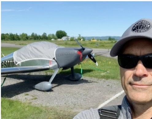
Van's RV-7 Travel Cover, Light Weight Canopy Cover