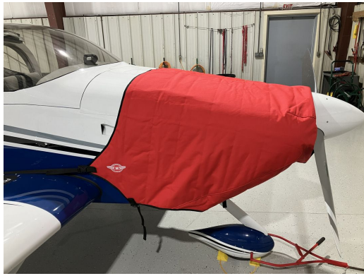
Van's Aircraft RV-7A Insulated Engine Cover