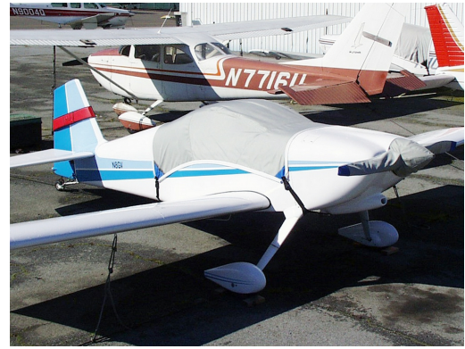
Vans's RV-6 Canopy Cover, Prop Cover