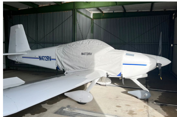
Vans RV-9A Extended Canopy Cover