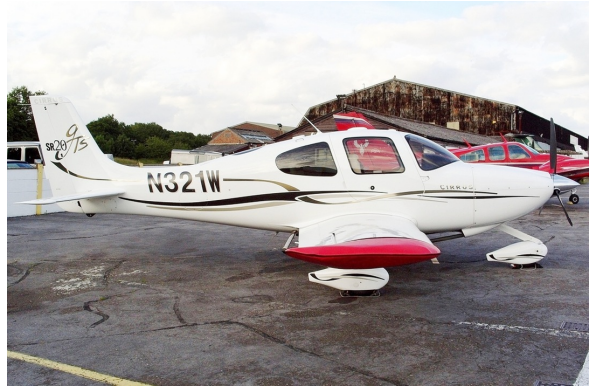
Cirrus SR-20/22 Wingtip Pads