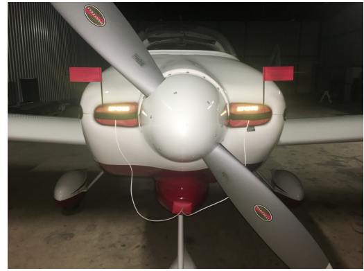
Van's Aircraft RV-7A Engine Inlet Plugs