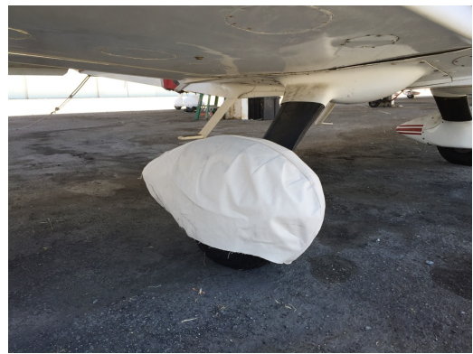
Grumman AA5 Main Wheelpant Cover, test fit