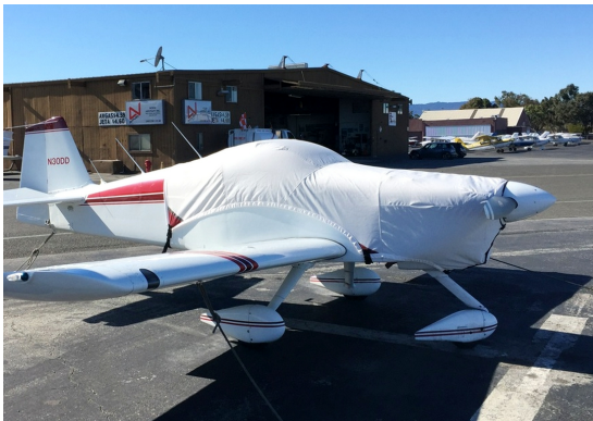
Van's RV-6A Canopy/Engine Cover

This cover type is made from Silver Acrylic Sunbrella canvas and is 100% lined with a soft and smooth microfiber. Bruce's Custom Covers developed this material combination especially for aircraft protection. The outer material is medium weight and treated for water resistance, UV resistance and anti-static buildup. The inner lining is a very soft and smooth microfiber to prevent scratching. The material is very reflective, and tests show that the cabin interior temperature can be reduced to near-ambient temperature on the hottest of days. It is water, ice and snow repellent, yet breathable to allow moisture to escape from between the cover and the aircraft surface.