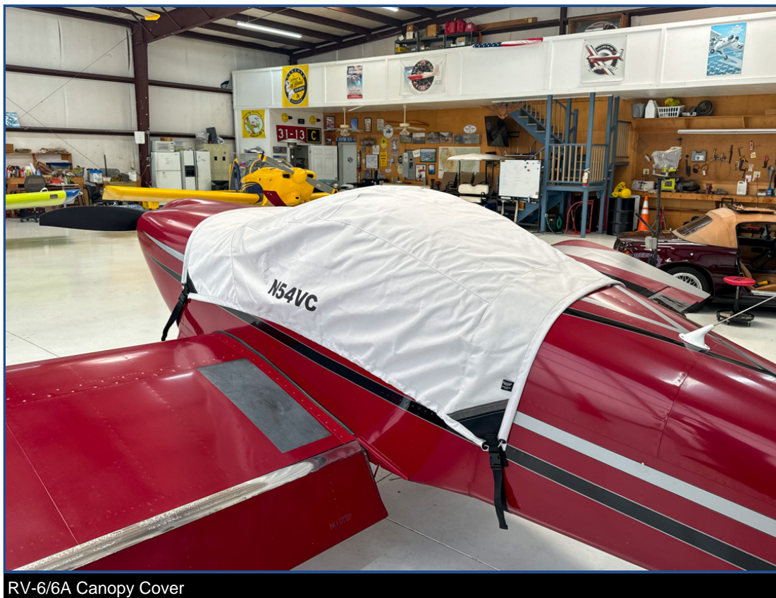
RV-6/6A Canopy Cover