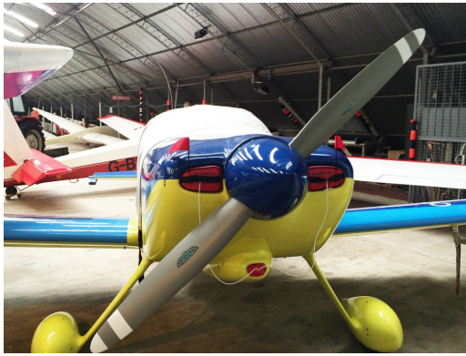
Van's RV-6 Engine Inlet Plugs