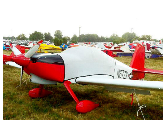
Light Weight Fitted Hangar Dust Cover