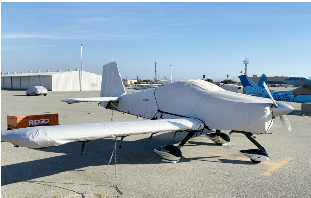
Van's RV-9A Extended Canopy/Engine, Wing & Empennage Covers