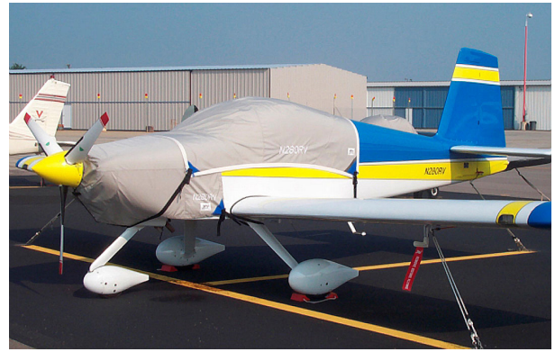
Van's RV-9 Canopy & Engine Covers