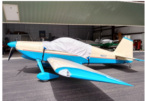
Van's RV-6 Canopy Cover