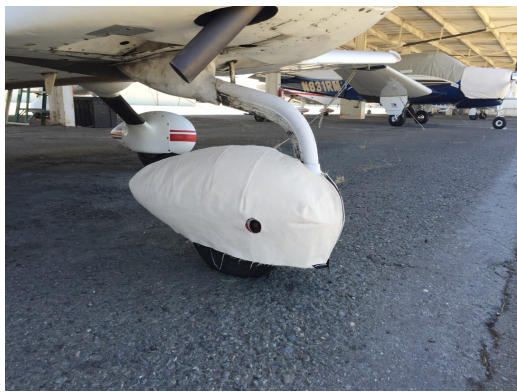
Grumman AA5 Nose Wheelpant Cover, test fit