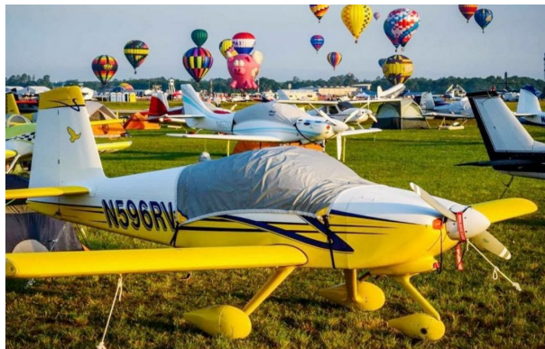
Vans's RV-9 Travel Weight Canopy Cover at Sun 'n Fun

Travel Covers are made with Silver Solution-Dyed Polyester fabric and only lined over the windshield to save weight. The material is lightweight and more compact for easy stowage in the aircraft. The polyester material is water resistant, but only intended for occasional use outside. We also have an ultra lightweight material available for fitted hangar dust covers. For daily outdoor use, the non-travel Sunbrella Cover is the best choice.