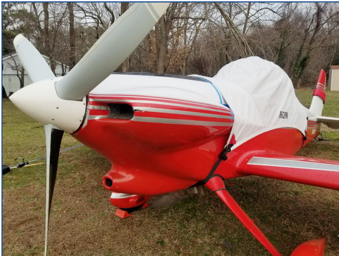
Vans RV-4 Canopy Cover