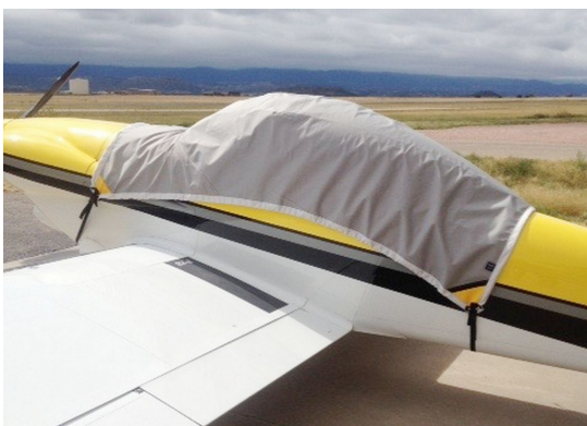
Van's Aircraft RV-4 Travel Cover, Light Weight Travel Canopy Cover, W/15" Fwd Extension, Belly Strap Type