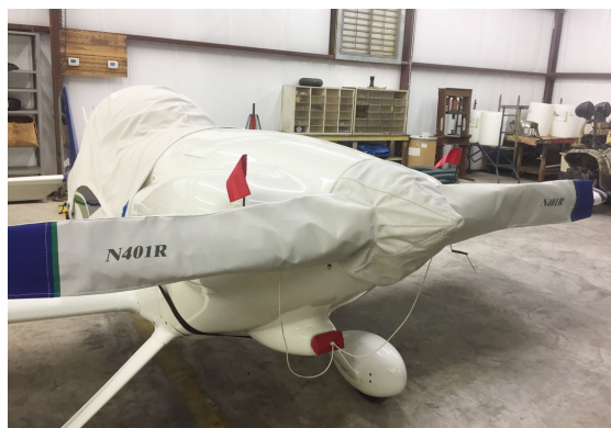
Van's Aircraft RV-4 Propellor/Spinner Cover, 2 Blade

This cover type is made from Silver Acrylic Sunbrella canvas and is 100% lined with a soft and smooth microfiber. Bruce's Custom Covers developed this material combination especially for aircraft protection. The outer material is medium weight and treated for water resistance, UV resistance and anti-static buildup. The inner lining is a very soft and smooth microfiber to prevent scratching. The material is very reflective, and tests show that the cabin interior temperature can be reduced to near-ambient temperature on the hottest of days. It is water, ice and snow repellent, yet breathable to allow moisture to escape from between the cover and the aircraft surface.