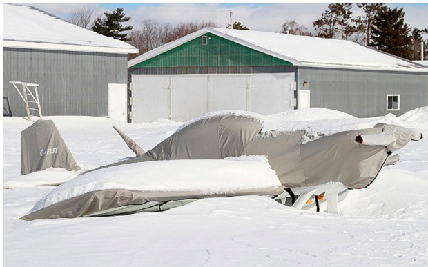
Van's RV-4 Complete Fuselage Cover

This cover type is made from Silver Acrylic Sunbrella canvas and is 100% lined with a soft and smooth microfiber. Bruce's Custom Covers developed this material combination especially for aircraft protection. The outer material is medium weight and treated for water resistance, UV resistance and anti-static buildup. The inner lining is a very soft and smooth microfiber to prevent scratching. The material is very reflective, and tests show that the cabin interior temperature can be reduced to near-ambient temperature on the hottest of days. It is water, ice and snow repellent, yet breathable to allow moisture to escape from between the cover and the aircraft surface.