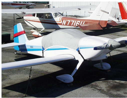
Vans's RV-6 Canopy Cover, Prop Cover