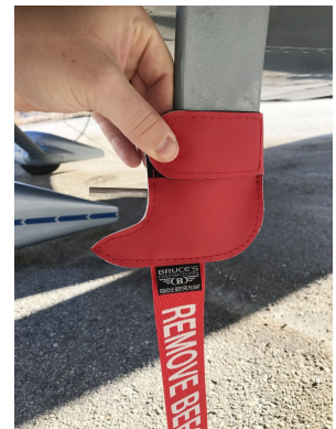
Van's RV-4 Custom Pitot Tube