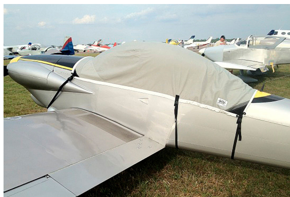
Van's RV-4 Canopy Cover

Travel Covers are made with Silver Solution-Dyed Polyester fabric and only lined over the windshield to save weight. The material is lightweight and more compact for easy stowage in the aircraft. The polyester material is water resistant, but only intended for occasional use outside. We also have an ultra lightweight material available for fitted hangar dust covers. For daily outdoor use, the non-travel Sunbrella Cover is the best choice.