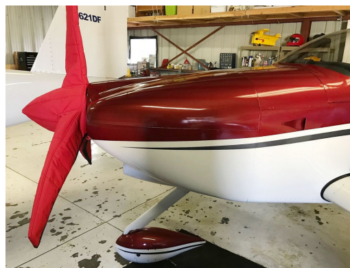
Van's RV-9 Insulated Prop Cover, 3-blade