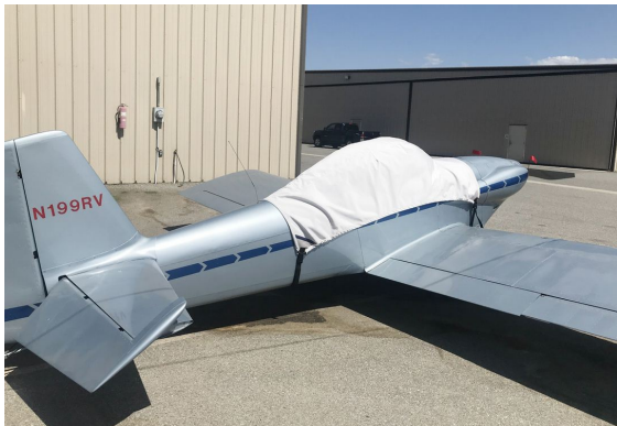
Van's RV-4 Canopy Cover