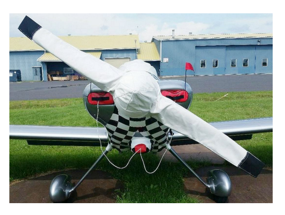
Van's RV-3 Engine Plugs, Prop/Spinner Cover