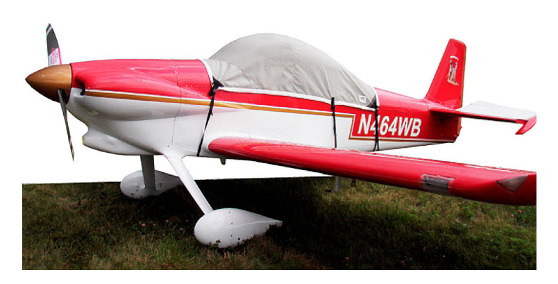
Vans's RV-3 Canopy Cover