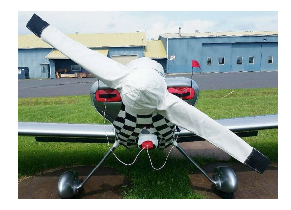
Van's RV-3 Engine Plugs, Prop/Spinner Cover