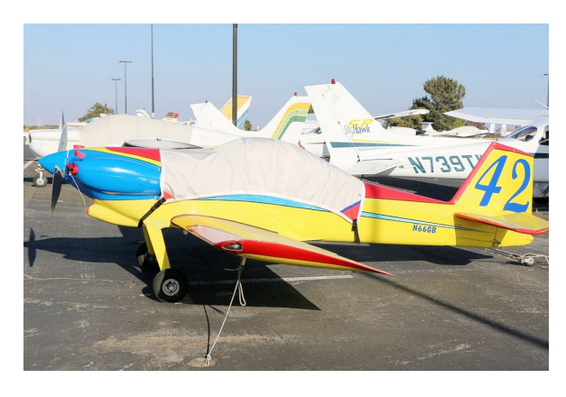
Van's RV-3 Canopy Cover and Engine Plugs