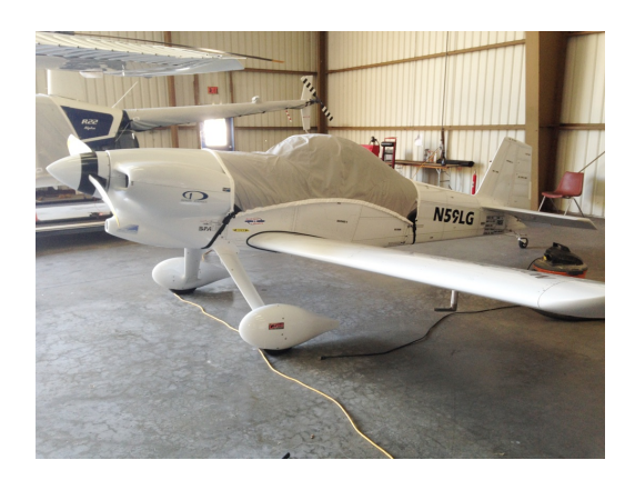
Van's RV-3 Light Weight Travel Cover